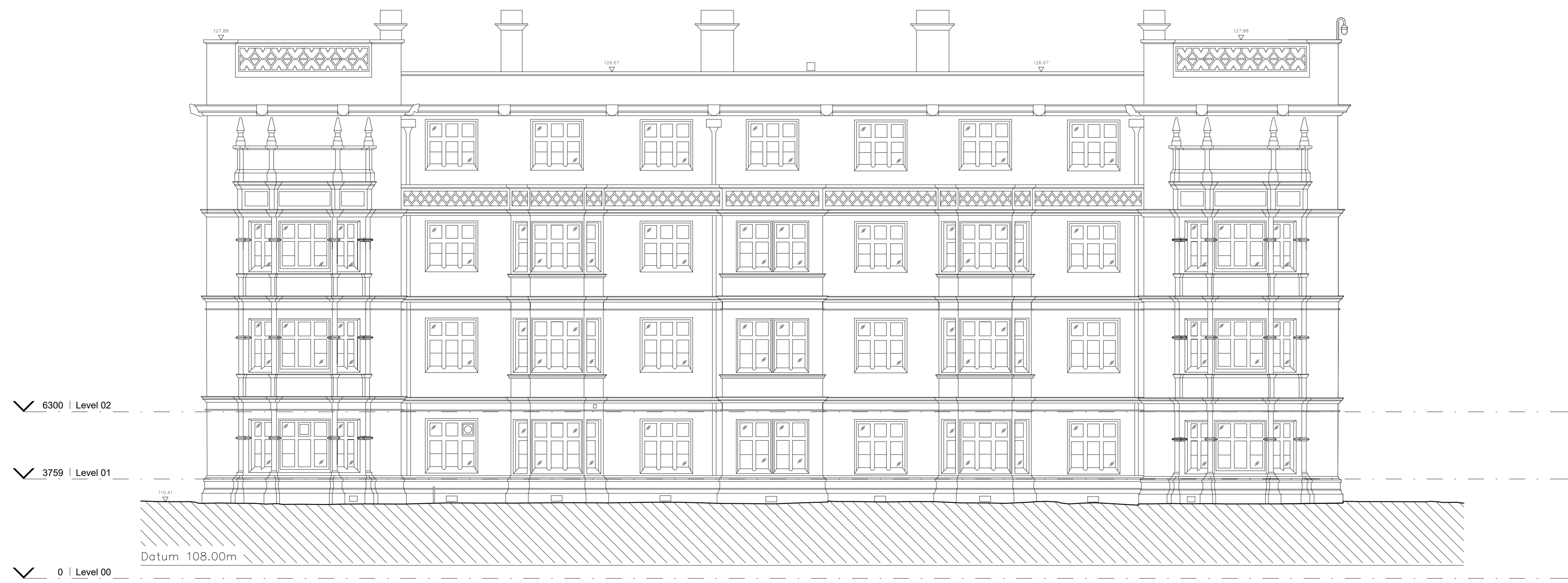
2 | South Fronts West - South 1:100