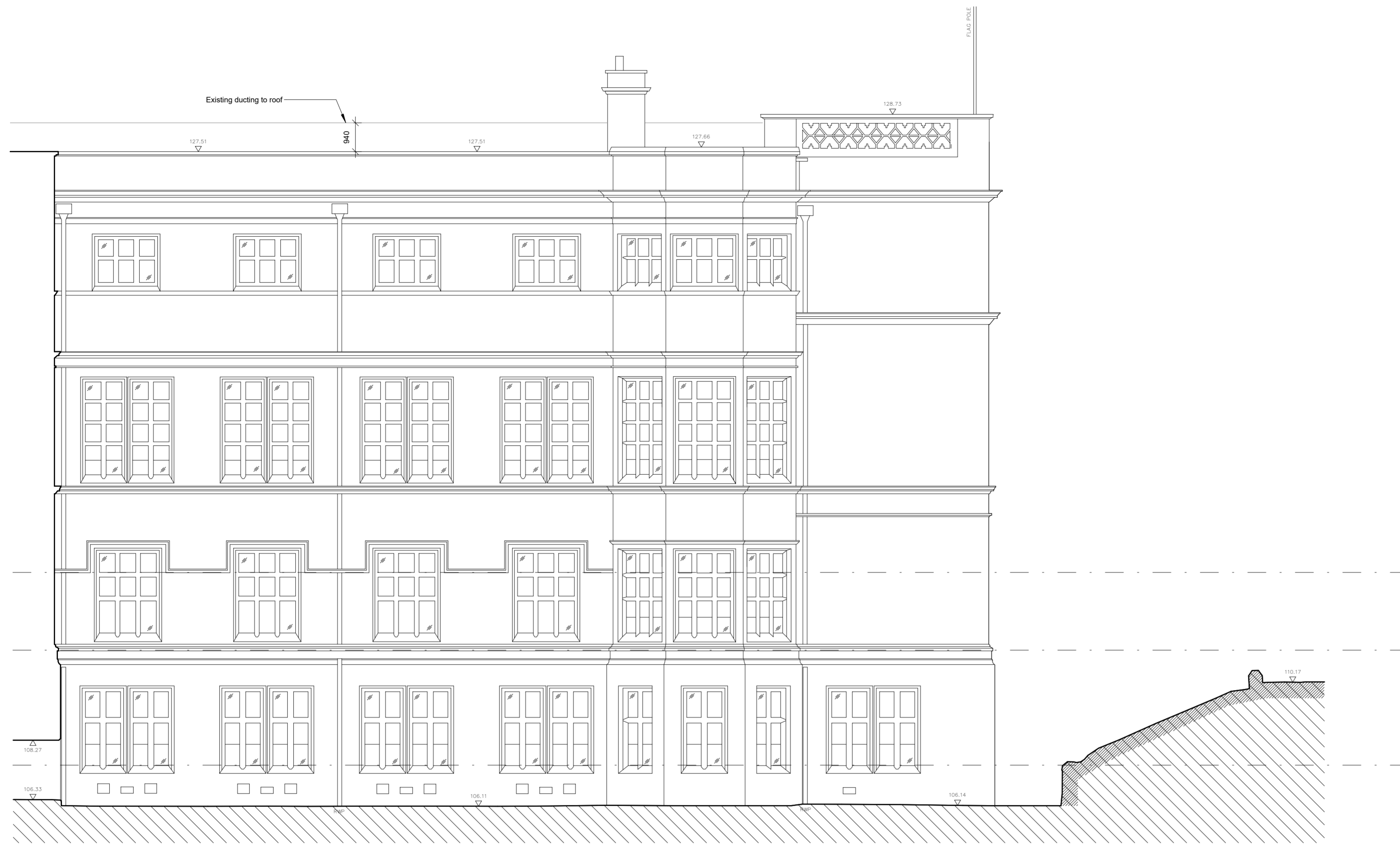
2 | South Fronts East - West 1:100