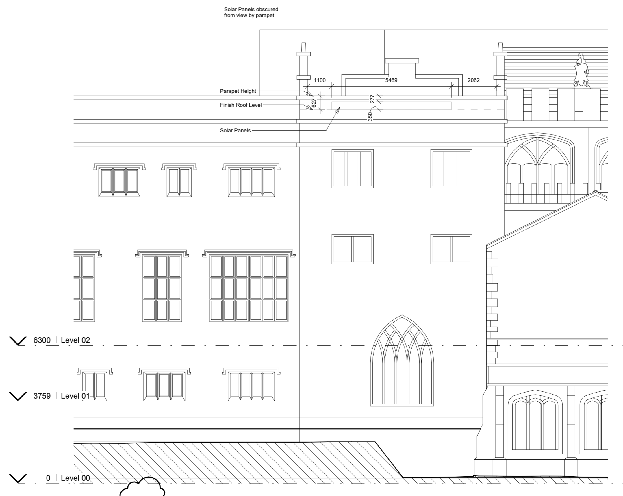
3 | West Front - Grade I Listed Proposed Elevation 1 : 100