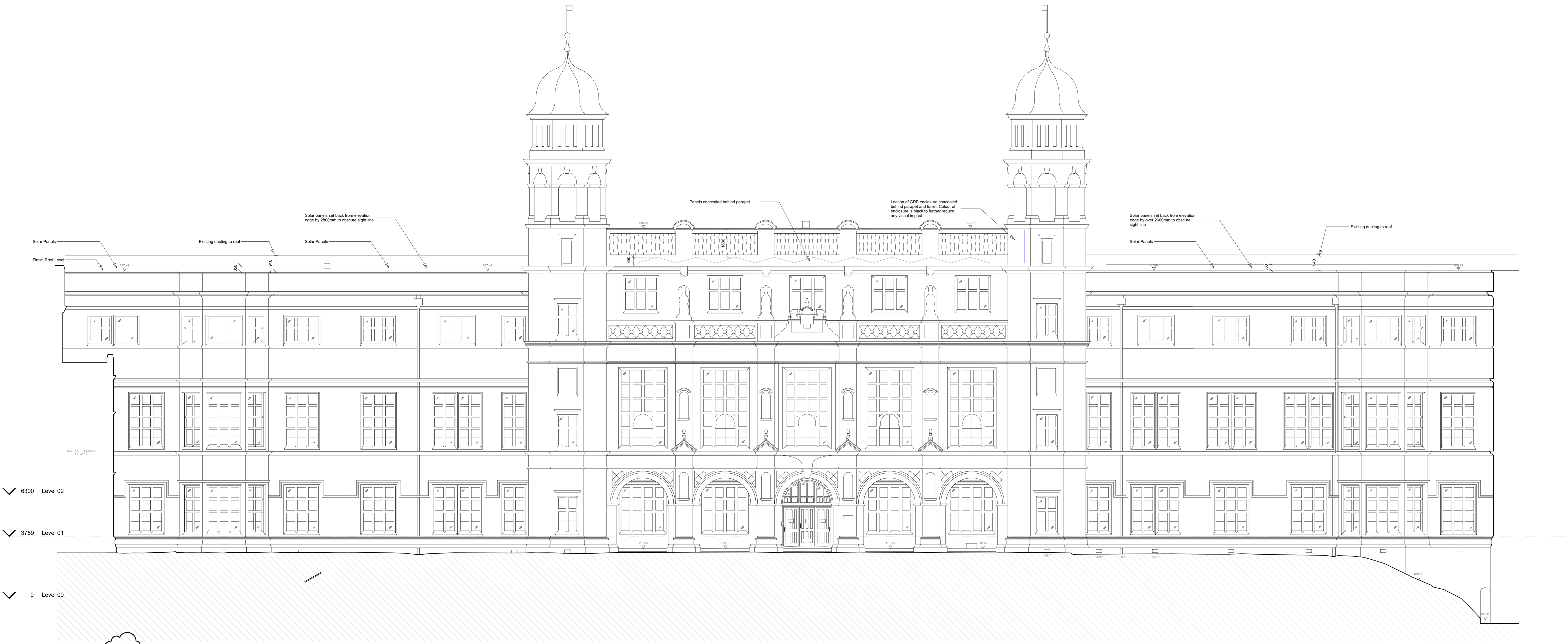
1 | South Fronts Middle - Grade II Listed South Proposed Elevation 1 : 100