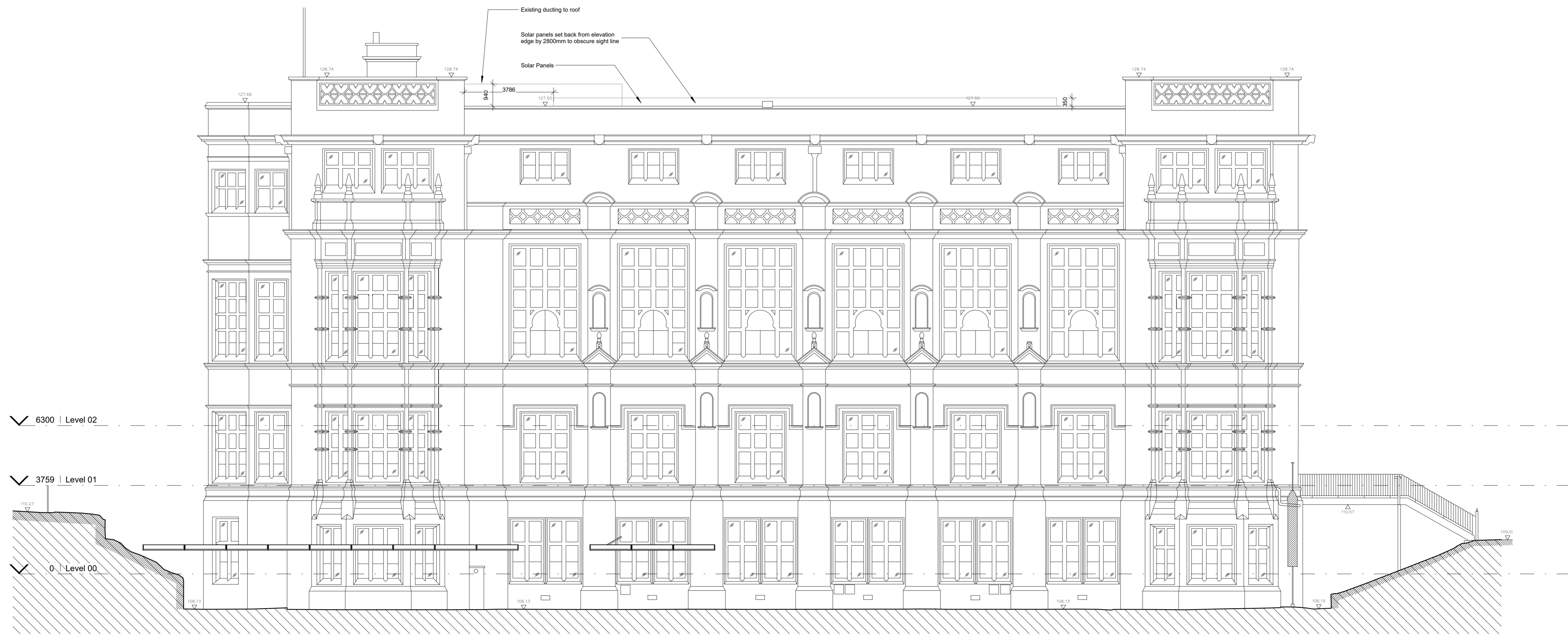
1 | South Fronts East - South Proposed Elevation 1:100