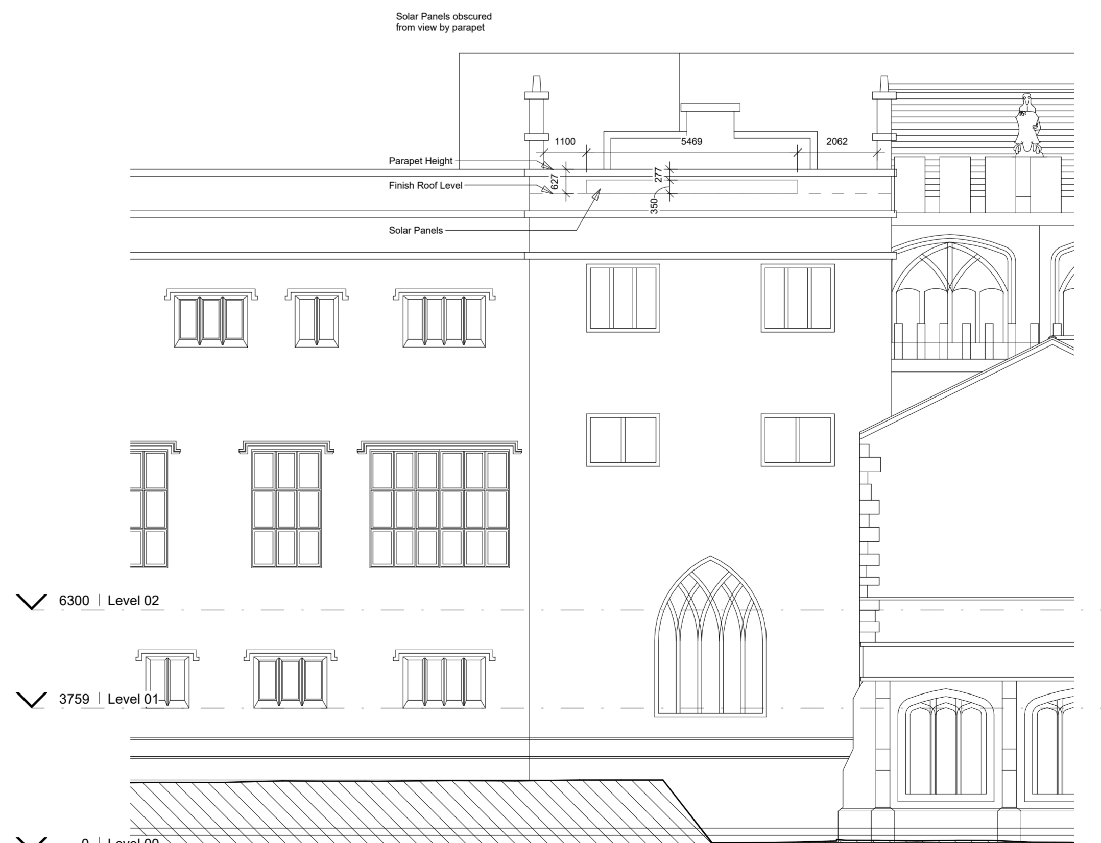
3 | West Front Proposed Elevation 1 : 100