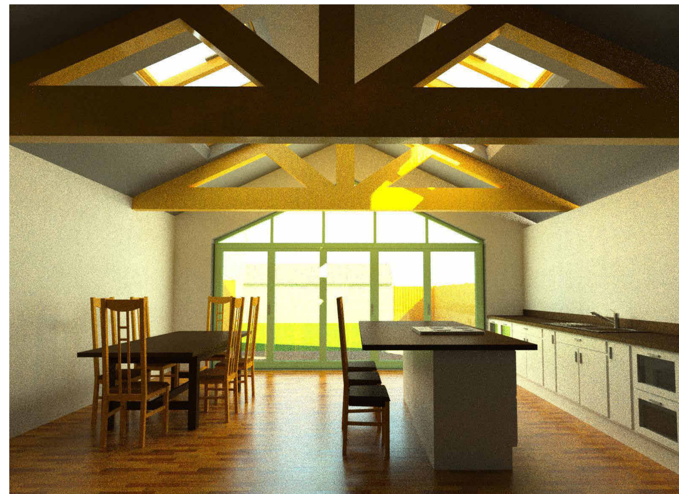
2 3D VISUAL 2