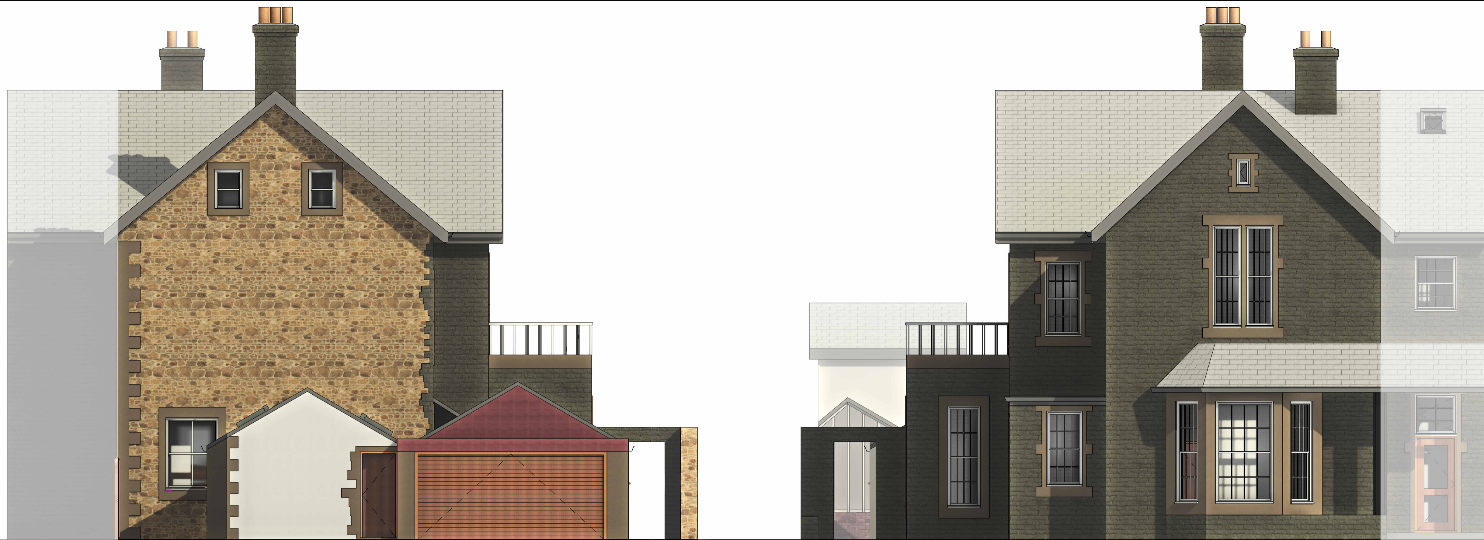
EXISTING NORTH EAST