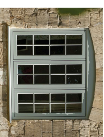
RESIDENCE R9 TIMBER EFFECT HERITAGE STYLE UPVC WINDOWS