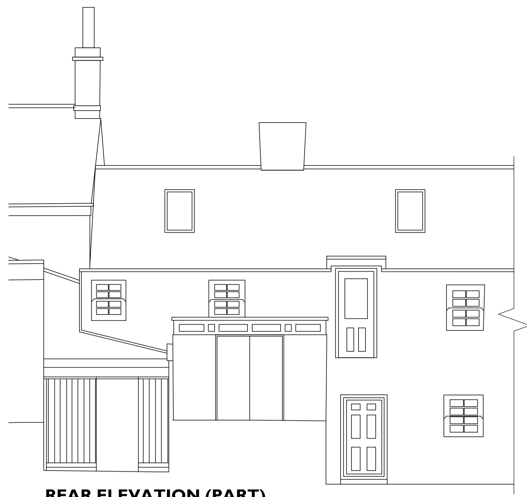
REAR ELEVATION (PART)

PARTY WALL ACT 1996 PLEASE NOTE THAT IF YOU INTEND TO CARRY OUT WORKS ON A WALL SHARED WITH ANOTHER PROPERTY, OR BUILD ADJACENT TO THE BOUNDARY WITH A NEIGHBOURING PROPERTY, OR EXCAVATE NEAR A NEIGHBOURING BUILDING YOU MUST FIND OUT WHETHER THAT WORKS FALLS WITHIN THE SCOPE OF THE PARTY WALL ACT 1996. IF IT DOES YOU MUST SERVE THE STATUTORY NOTICE ON ALL AFFECTED OWNERS