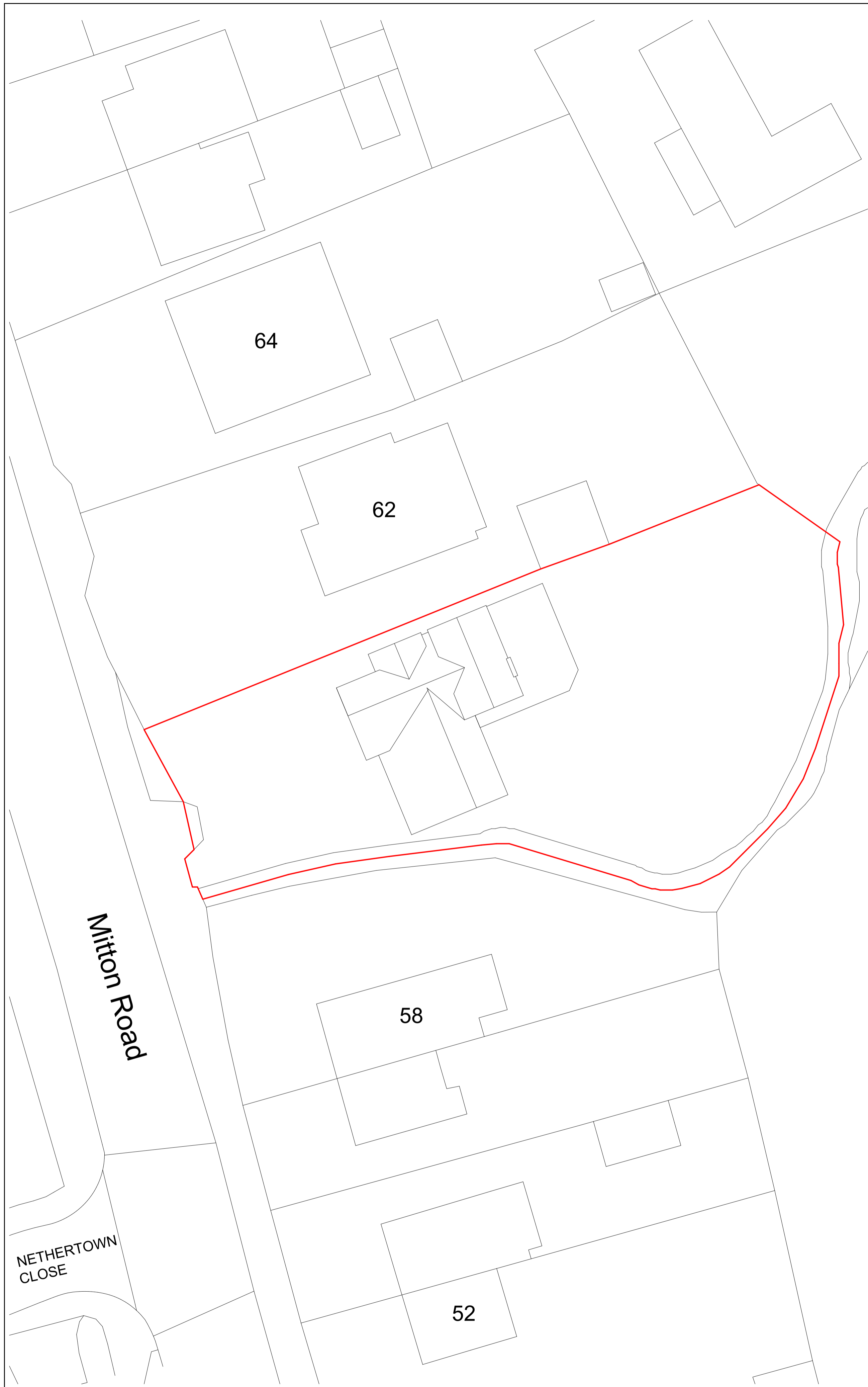
1 EXISTING SITE PLAN 1 : 200