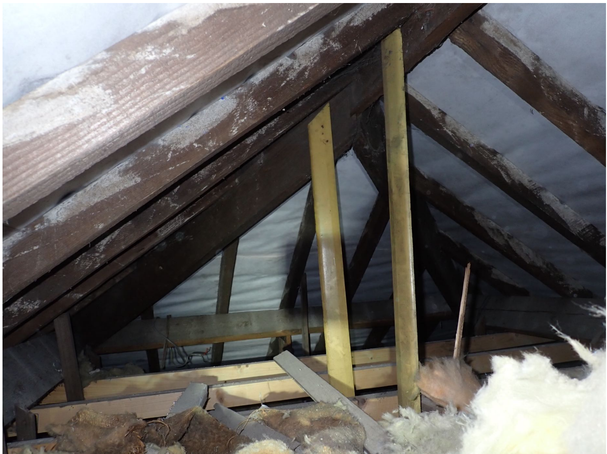
8 – The small roof void to the rear of the house.