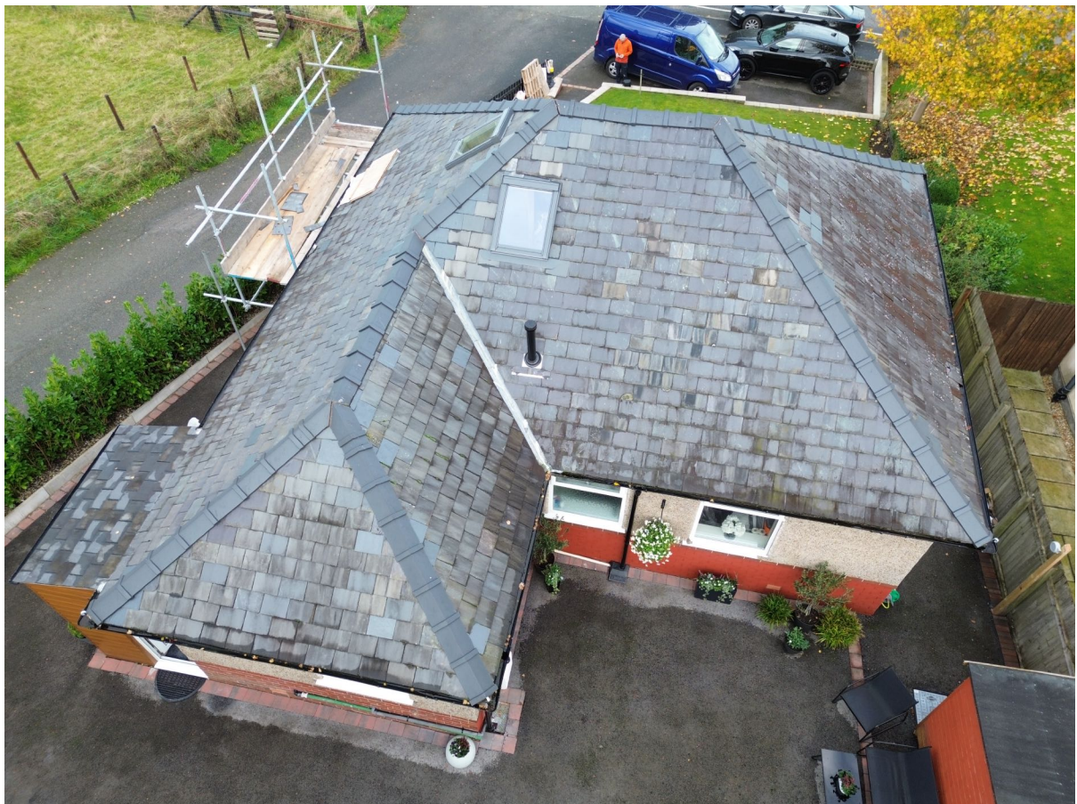
2 – The rear of the house.