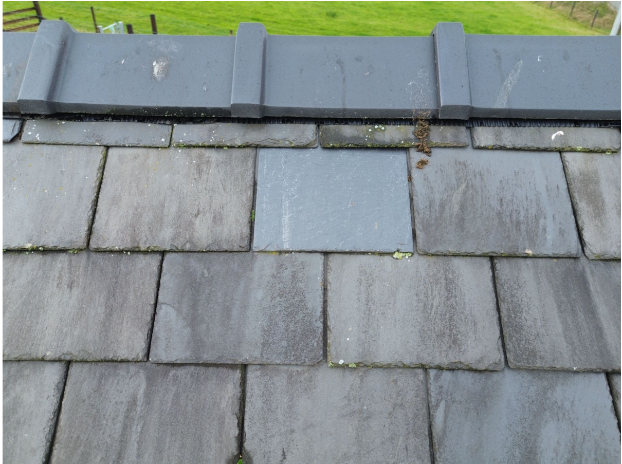
3 – Roof and ridge tiles are in good condition with no suitable gaps.