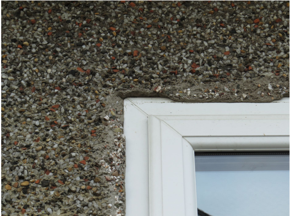
7 – Window and door frames are tightly sealed into brickwork with no suitable gaps.