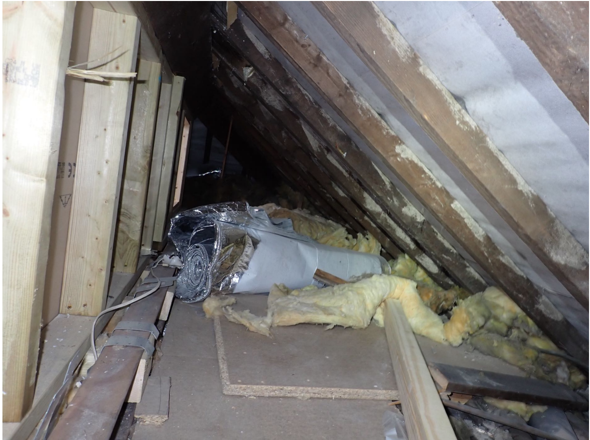
9 – Crawl spaces at the eaves.