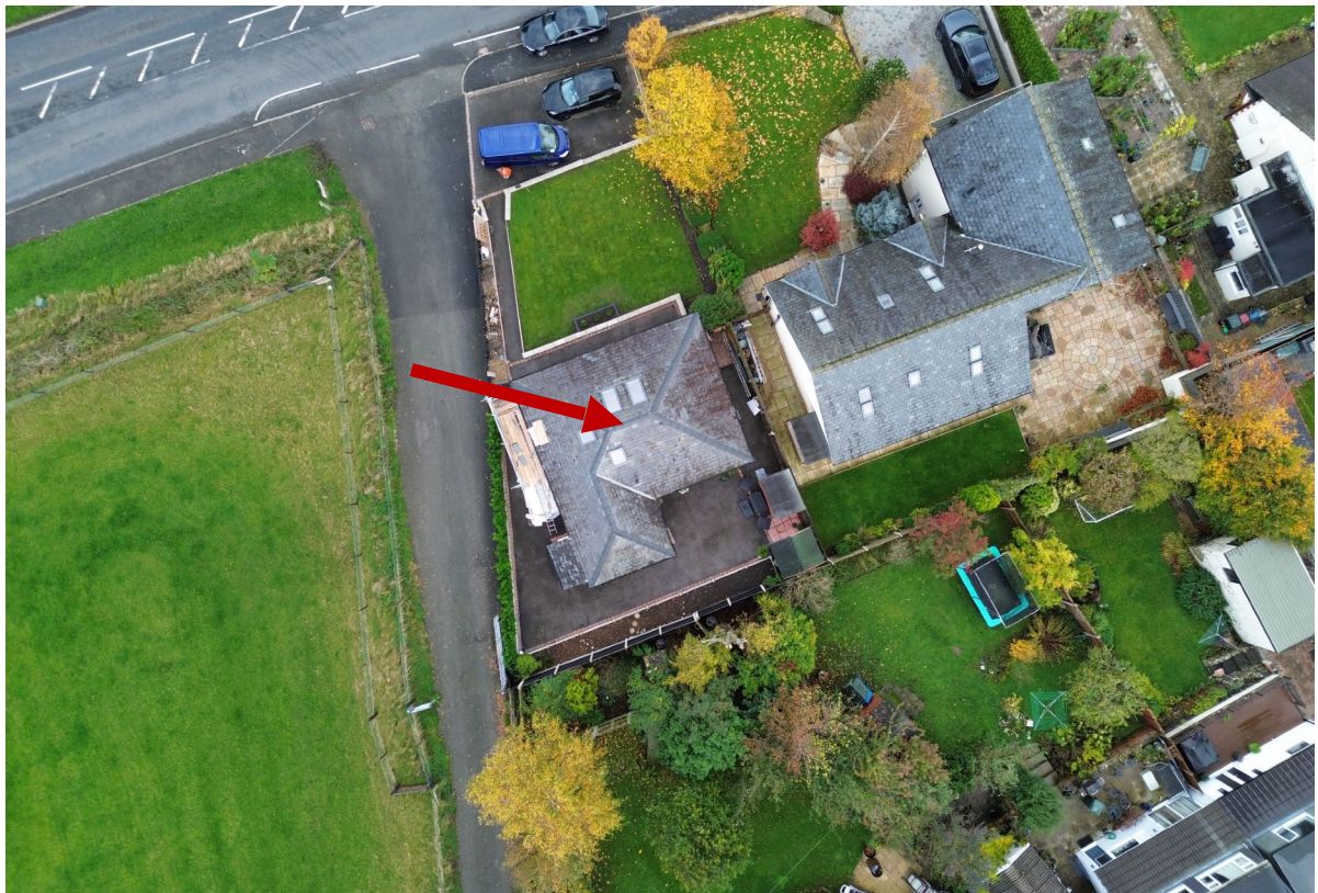
1.6b – Thornlee - Whalley Road – aerial photograph.