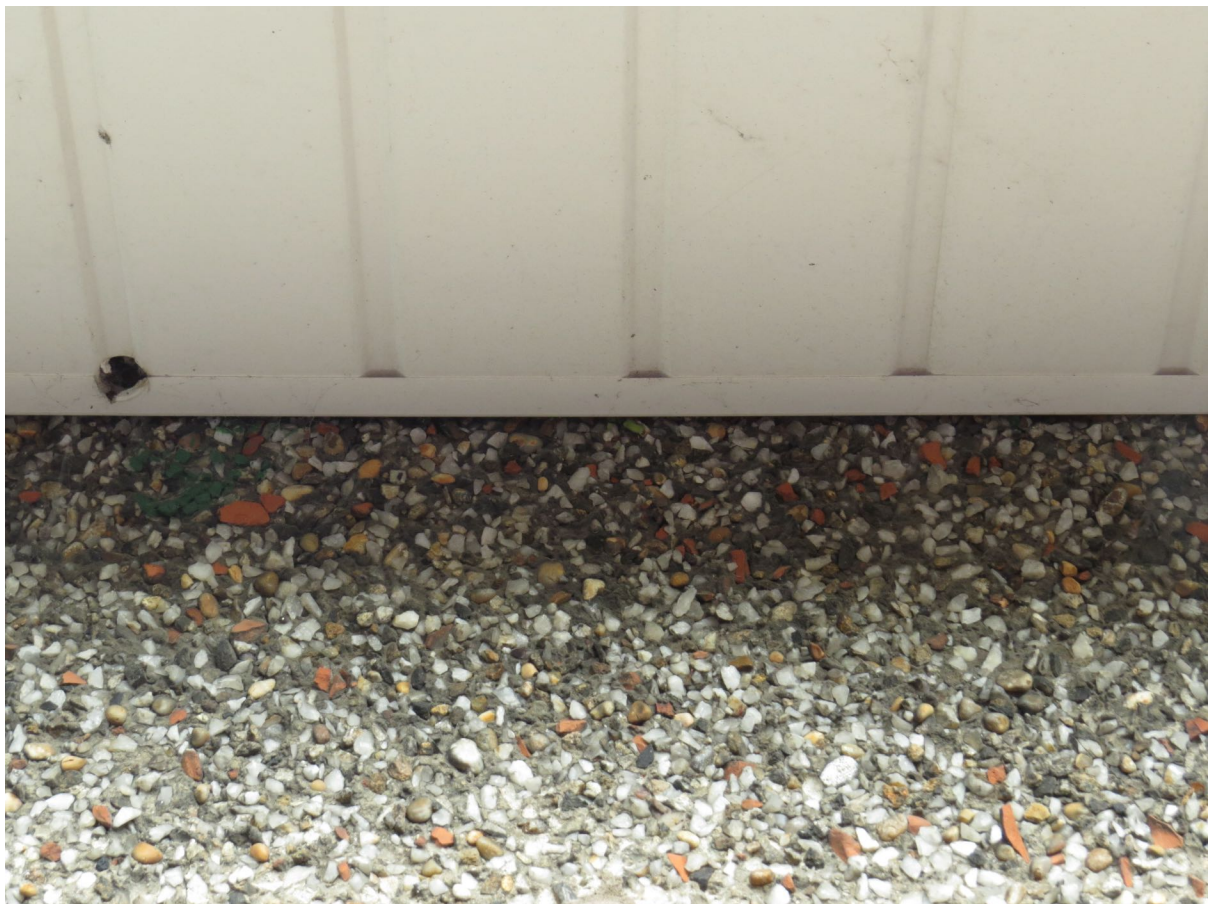
4 – Fascia boards and soffits at the eaves are fixed tightly against brickwork.