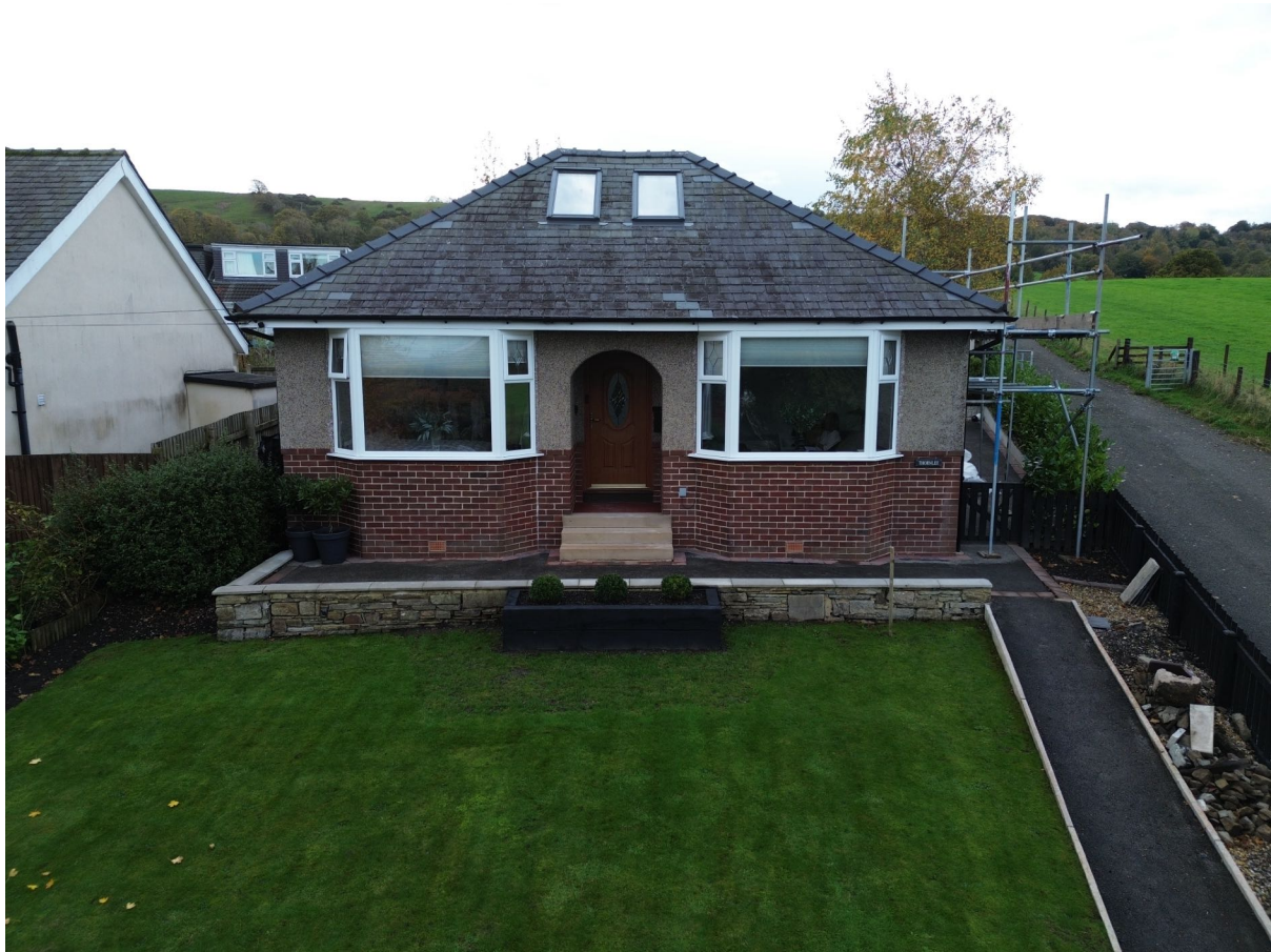
3.1a – The front of the house.

Thornlee, Whalley Road, Billington, is a pre-1950's detached bungalow, which is currently occupied. It has a pitched, hipped, roof, covered with slate roof tiles and ceramic ridge tiles. The roof was replaced by the previous owner approximately four years ago. A small ground floor extension to the rear has a single pitched roof covered with slate roof tiles.