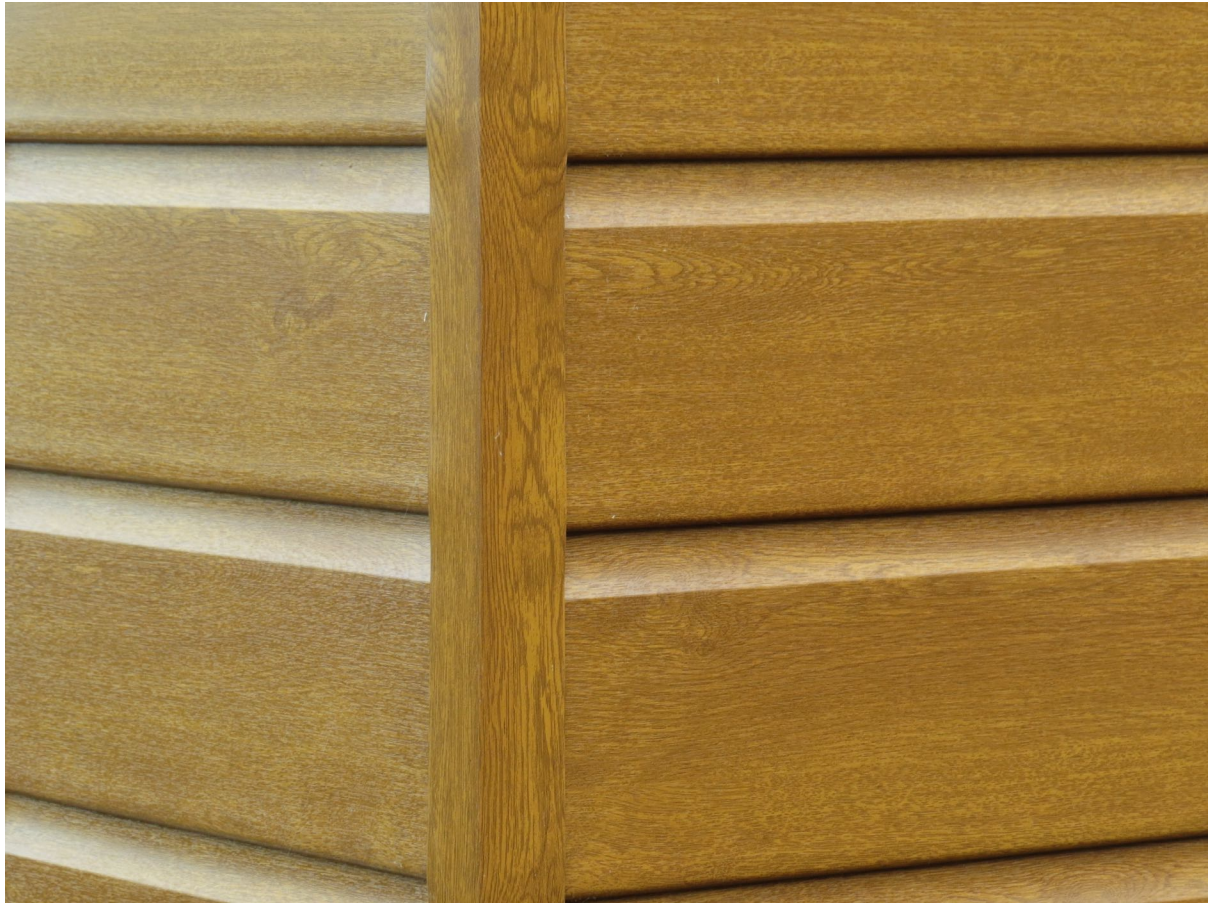
5 – Cladding on the rear extension is fitted tightly with no suitable gaps.