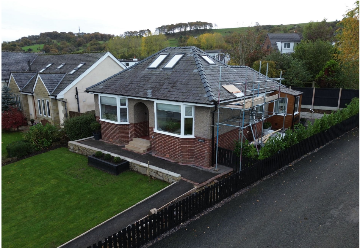
1 – The front of the house.