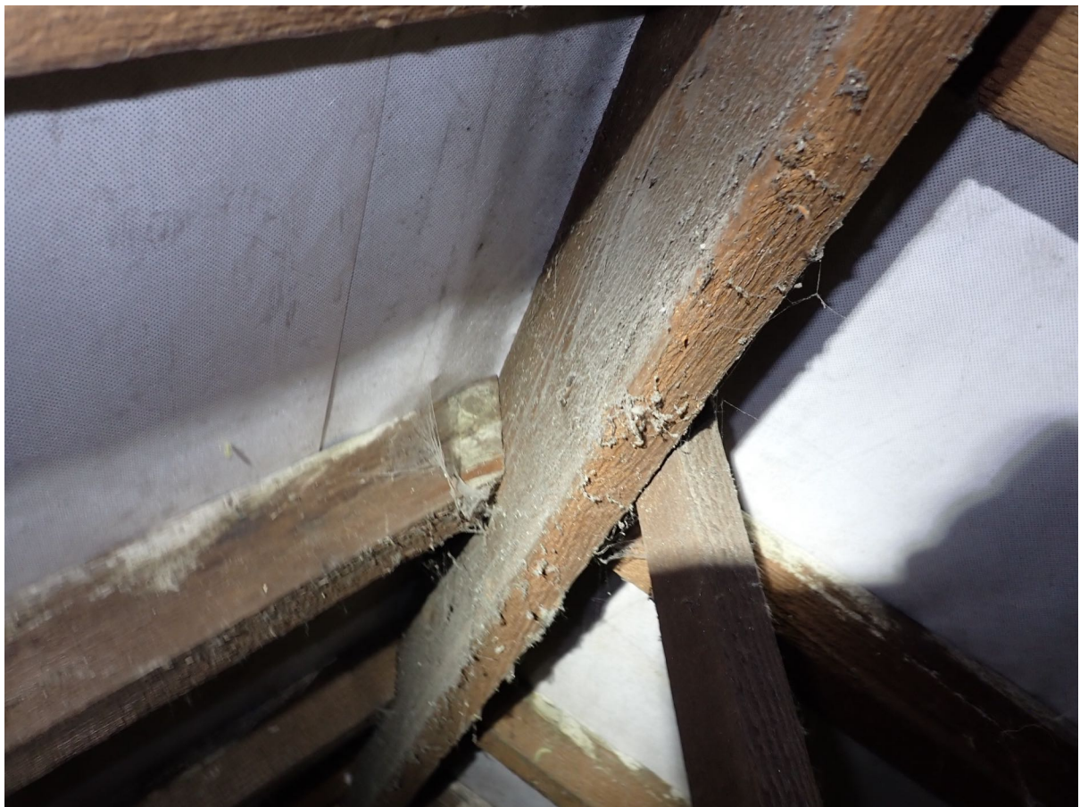
10 – Roof lining is in good condition with no gaps or tears.