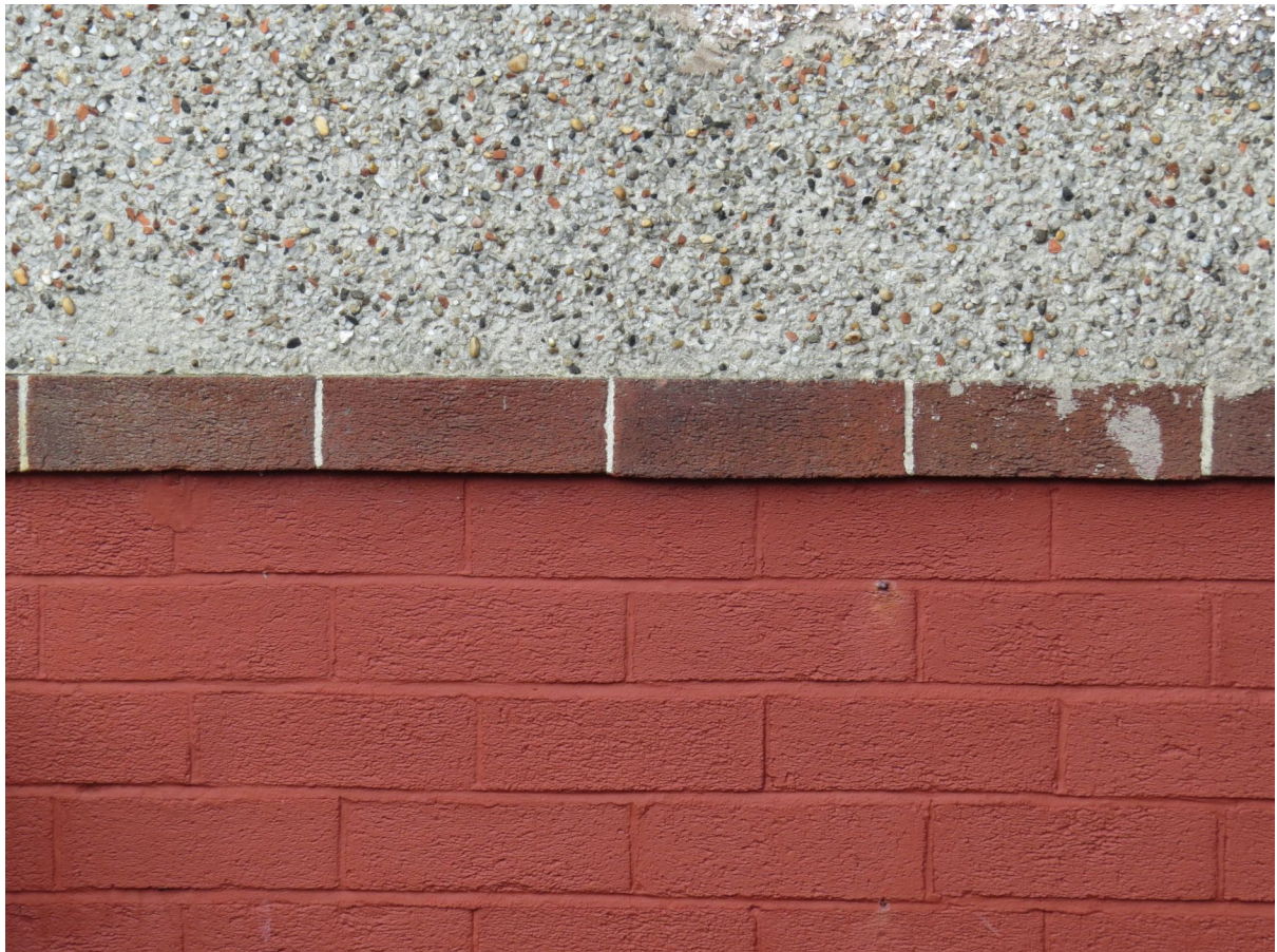
6 – Brickwork and render are in good condition with no suitable gaps.