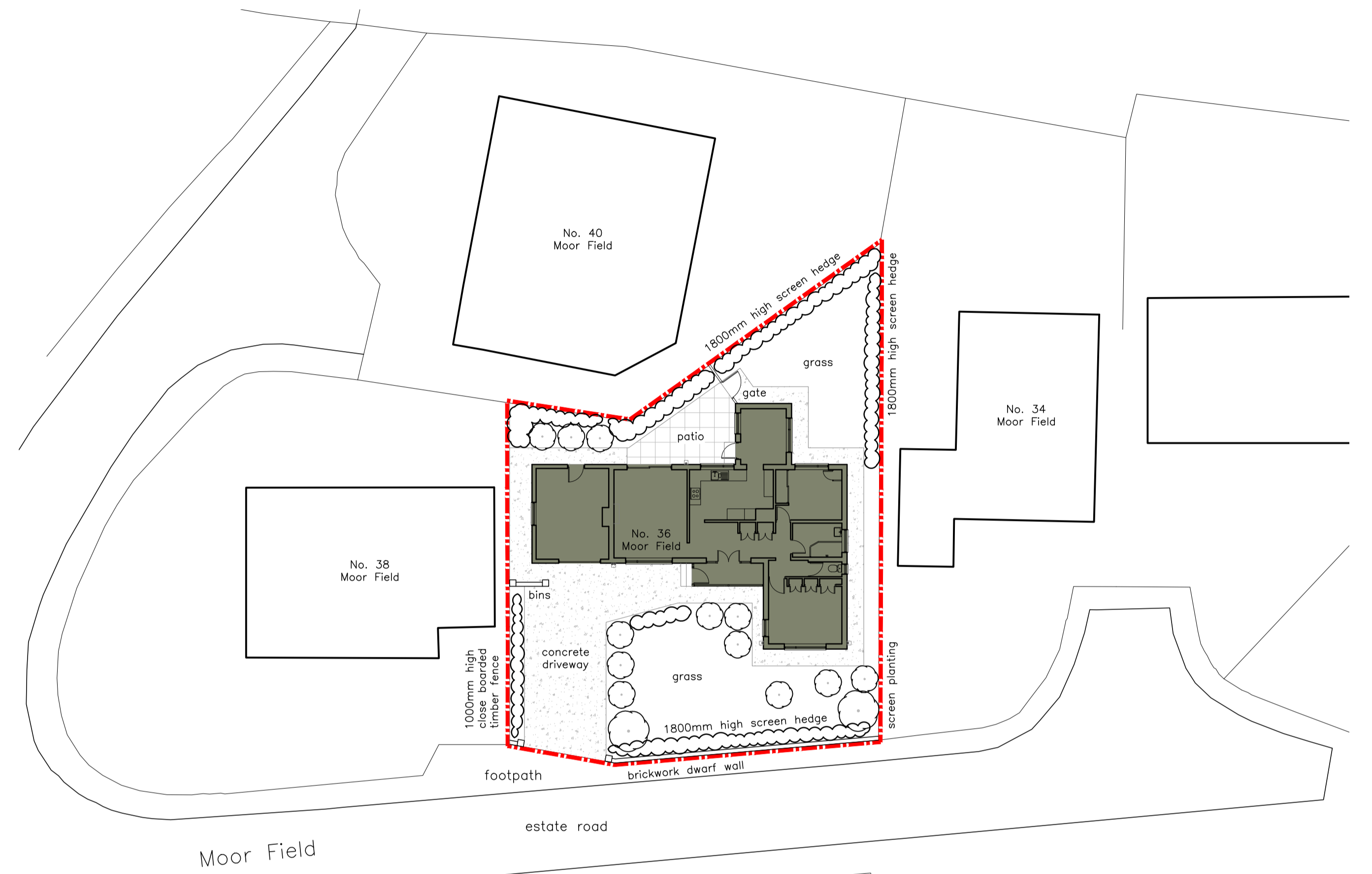
EXISTING SITE PLAN scale 1:200