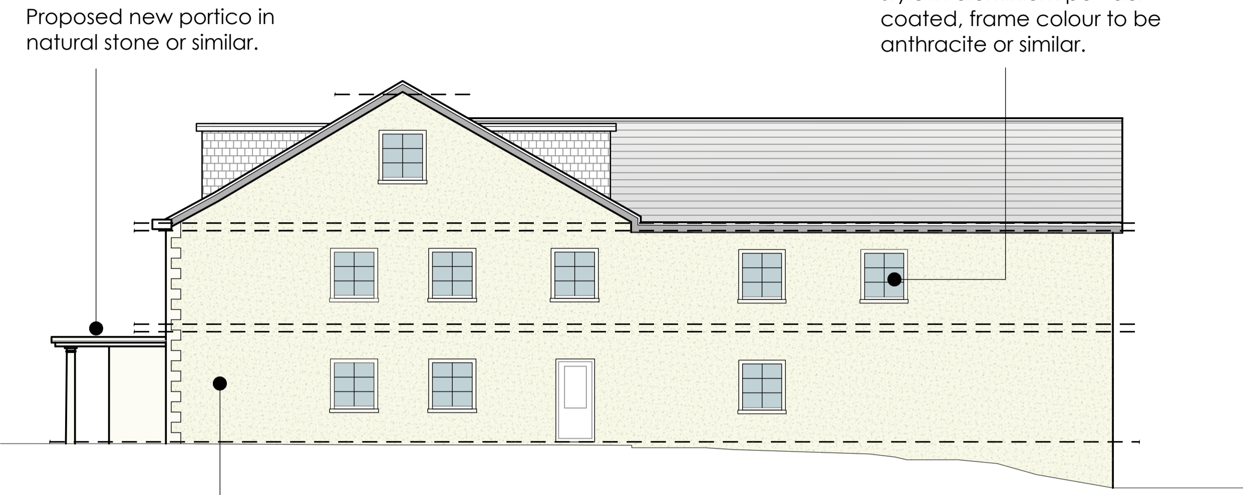
PROPOSED SIDE ELEVATION A 1:100