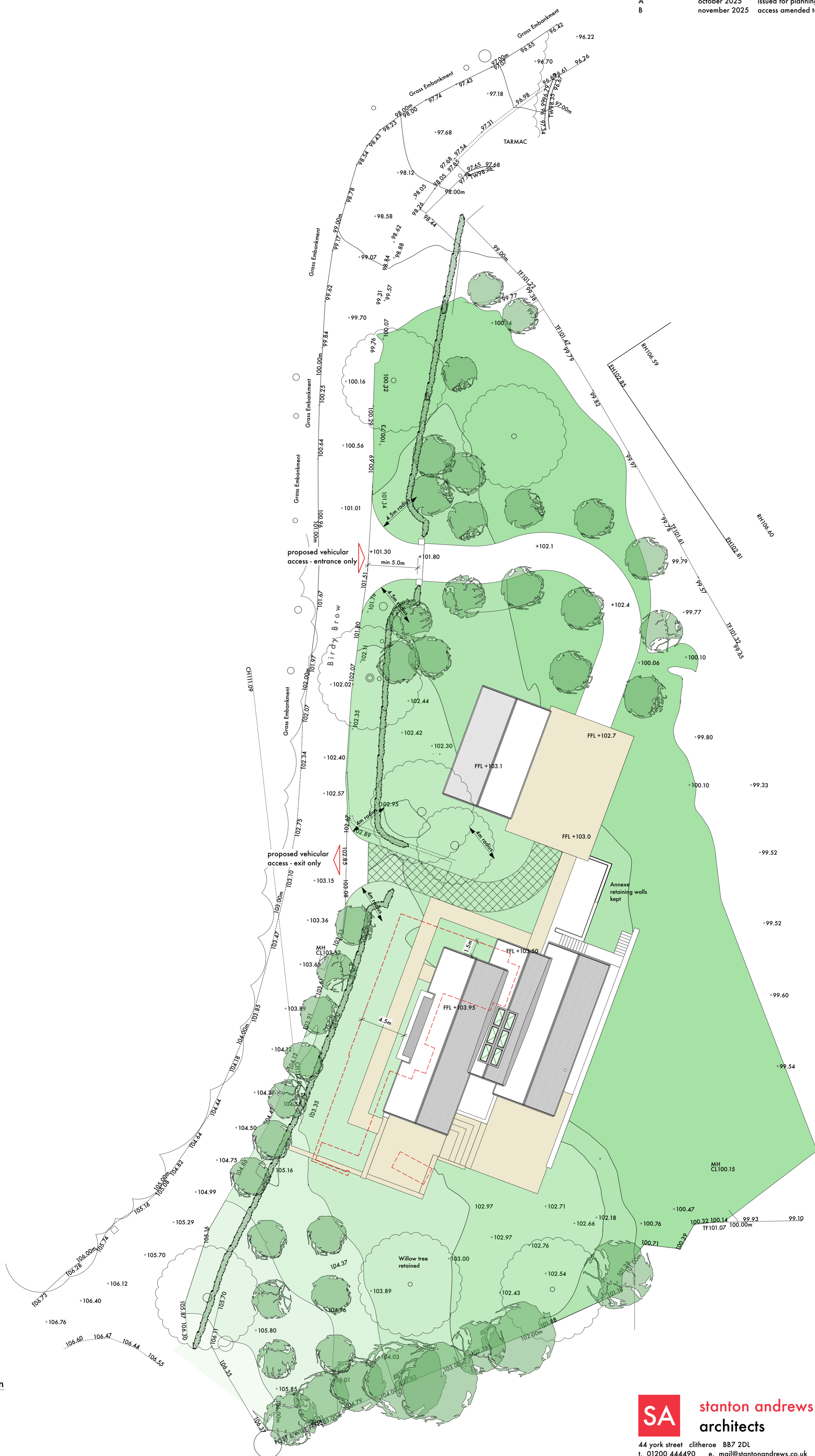
0 Site and Roof Plan Scale: 1:200