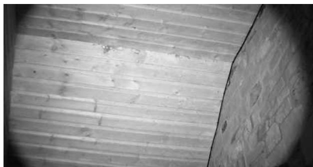
Illumination level at end of survey

No bats were observed to emerge from the building.