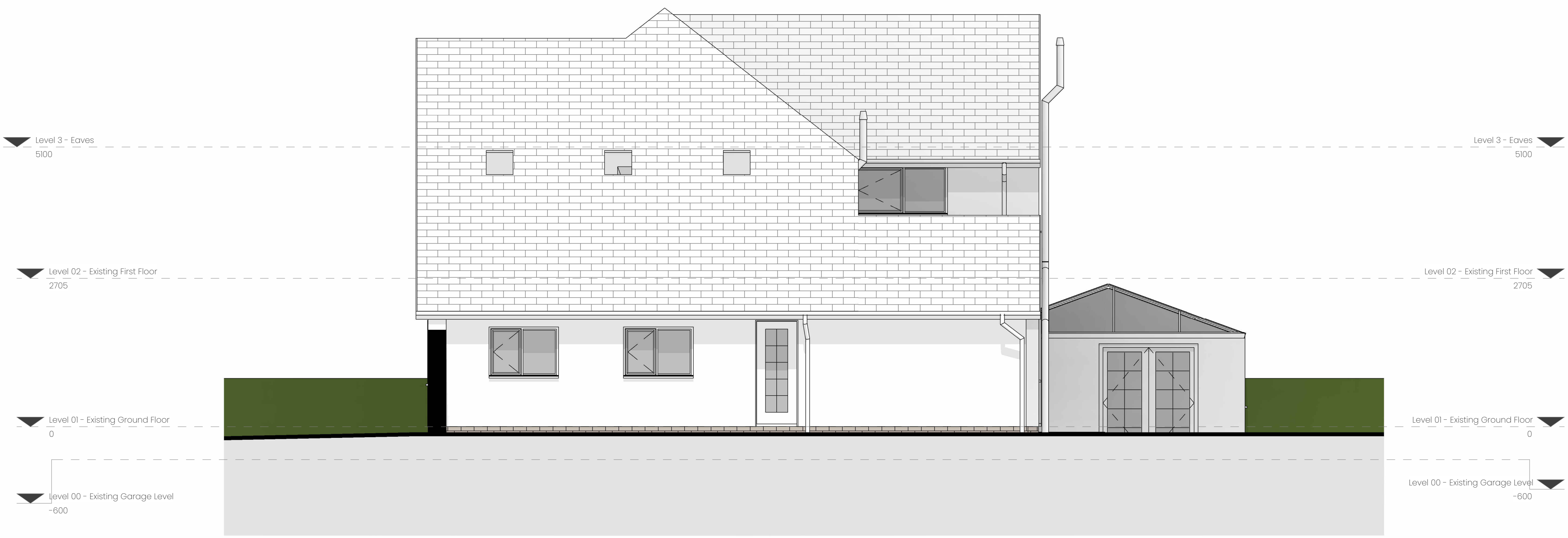
2 Existing South East Elevation 1:50