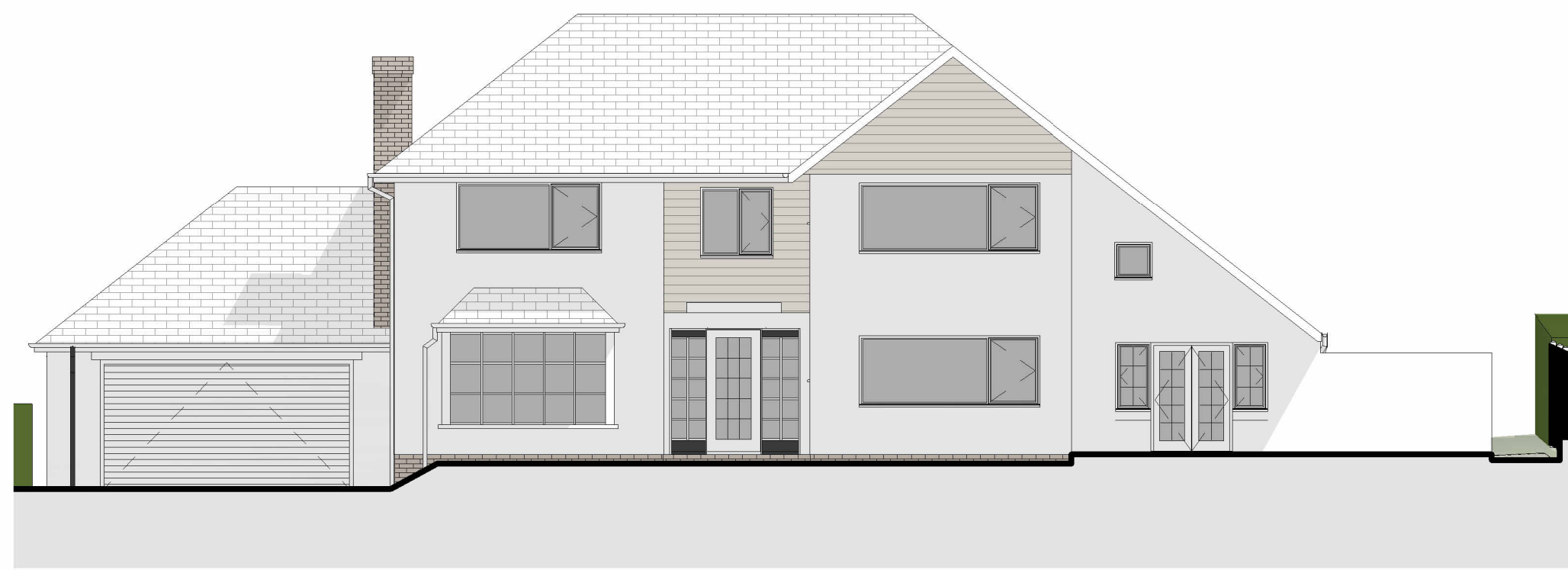
2 South West Elevation 1:100