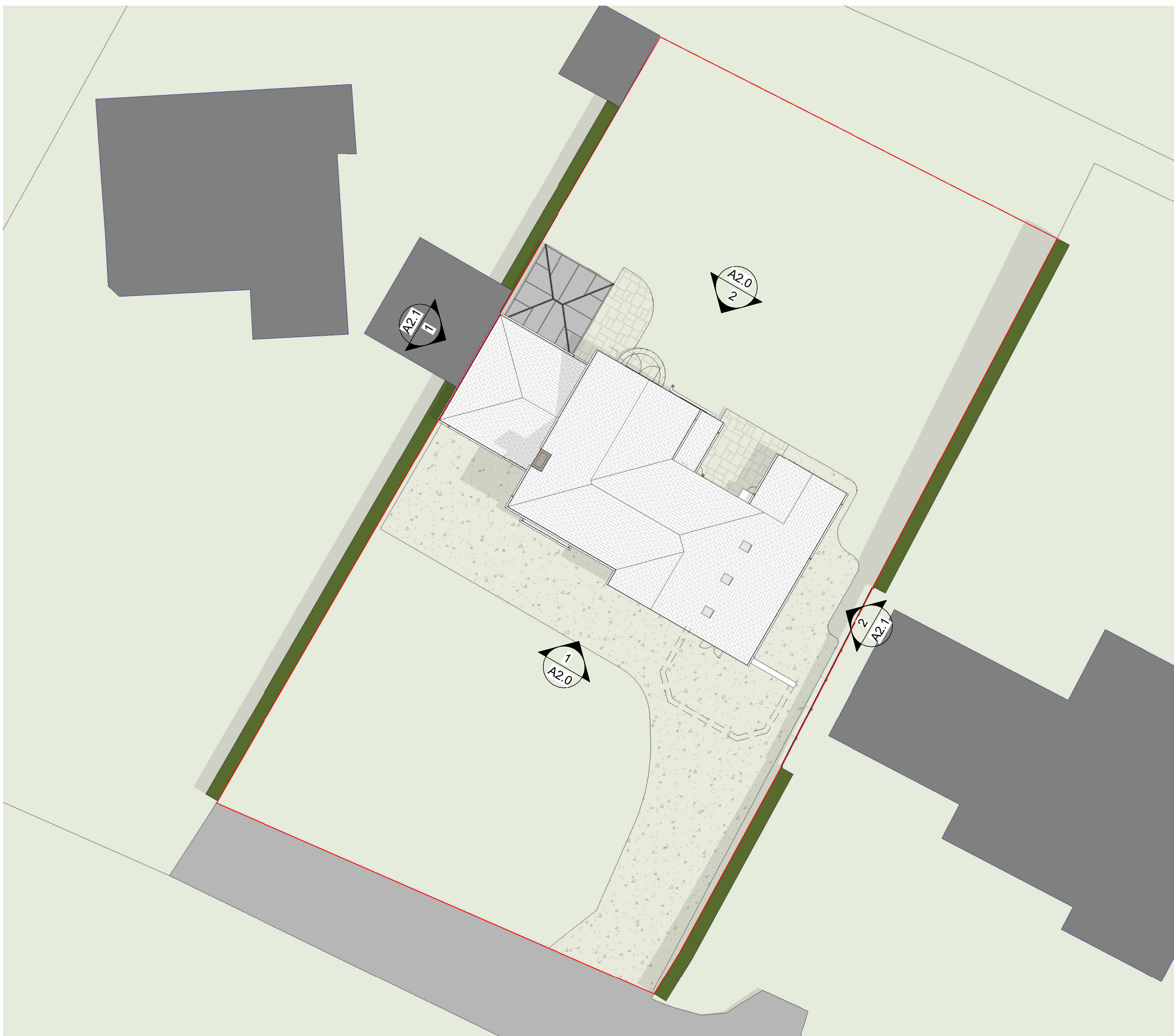
1 Level 03 - Existing Site Plan 1:200

Sheet Name: Existing Site Plan & Elevations