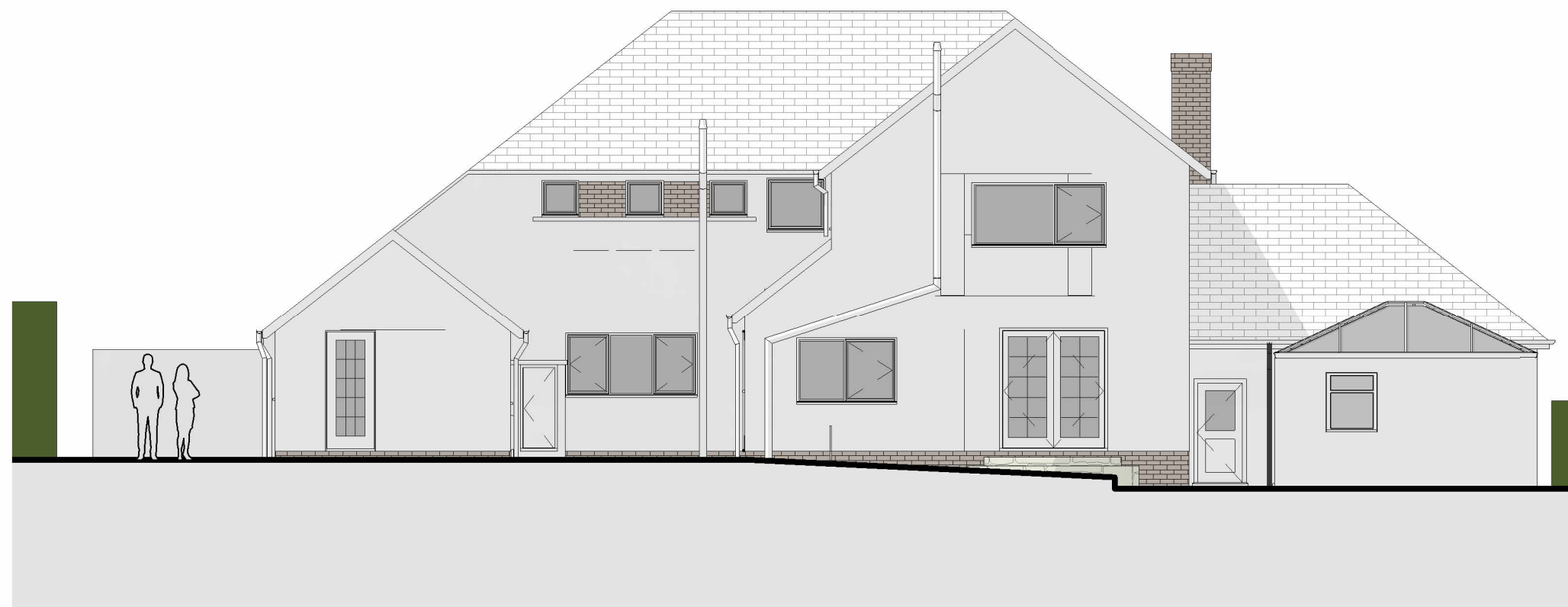
3 North East Elevation 1:100