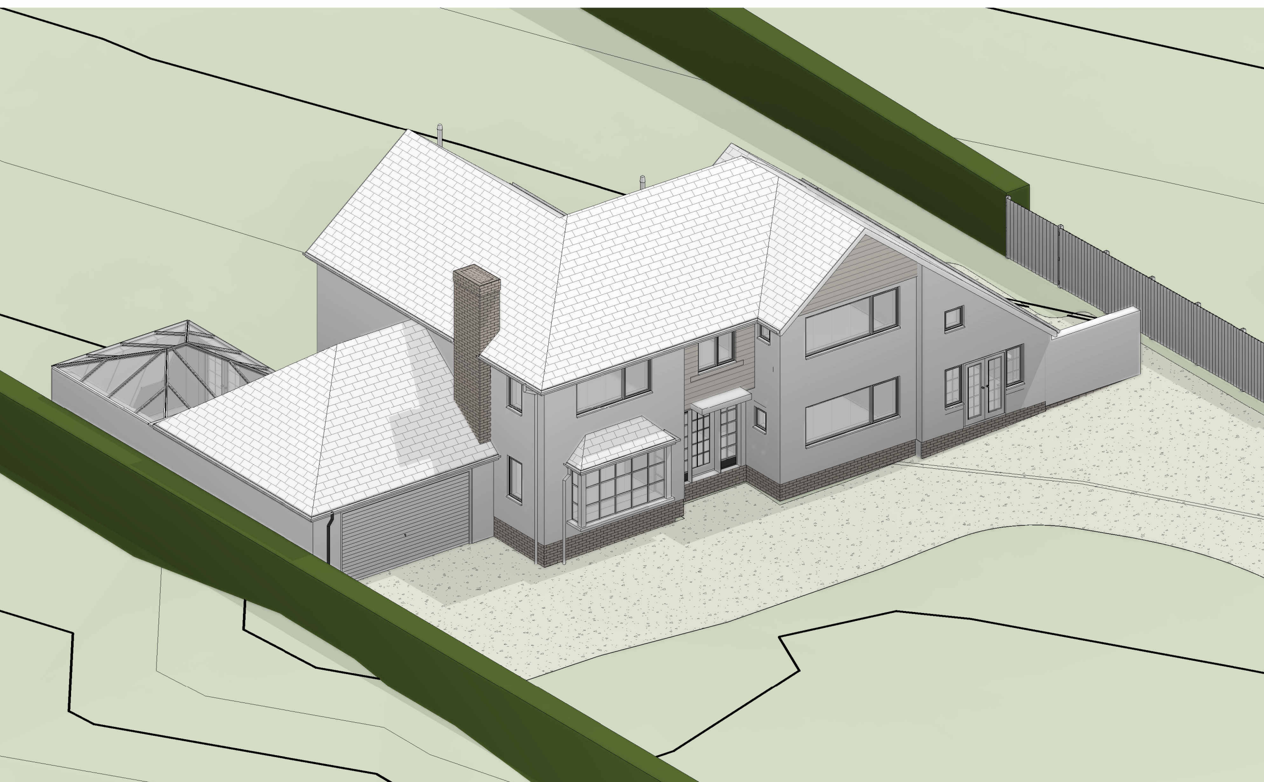
6 Existing Ortho (Front)