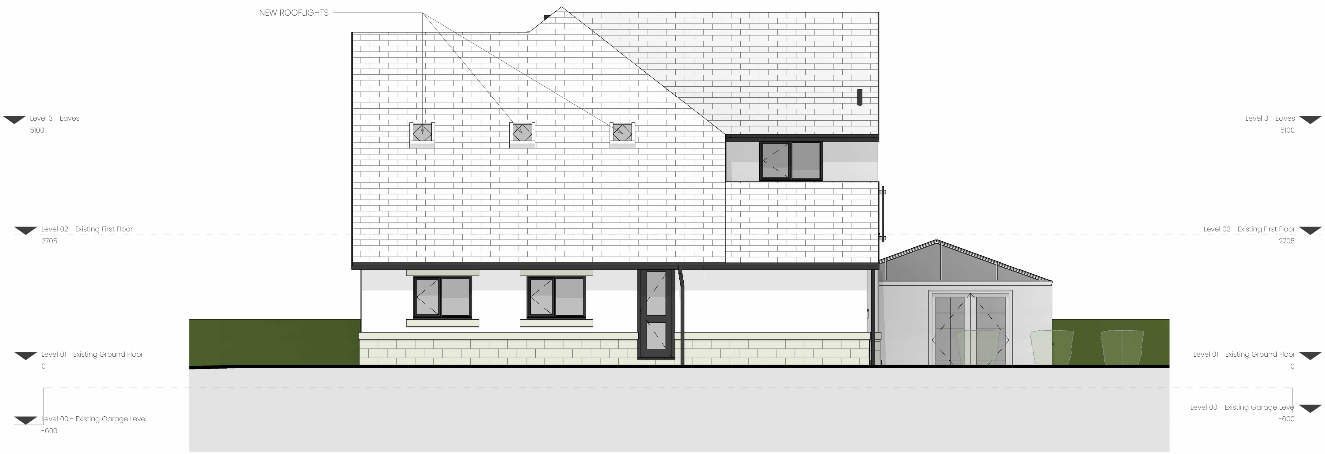
2 Proposed South East Elevation 1: 50