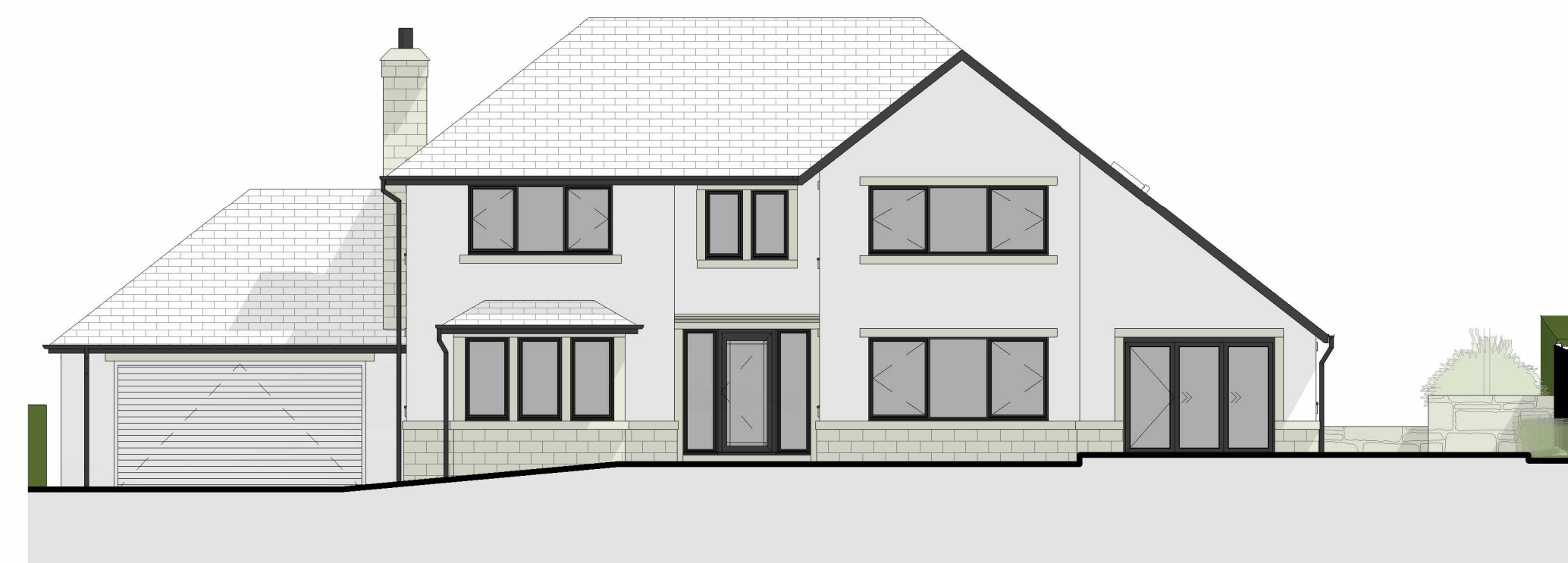
2 South West Elevation - Proposed 1:100