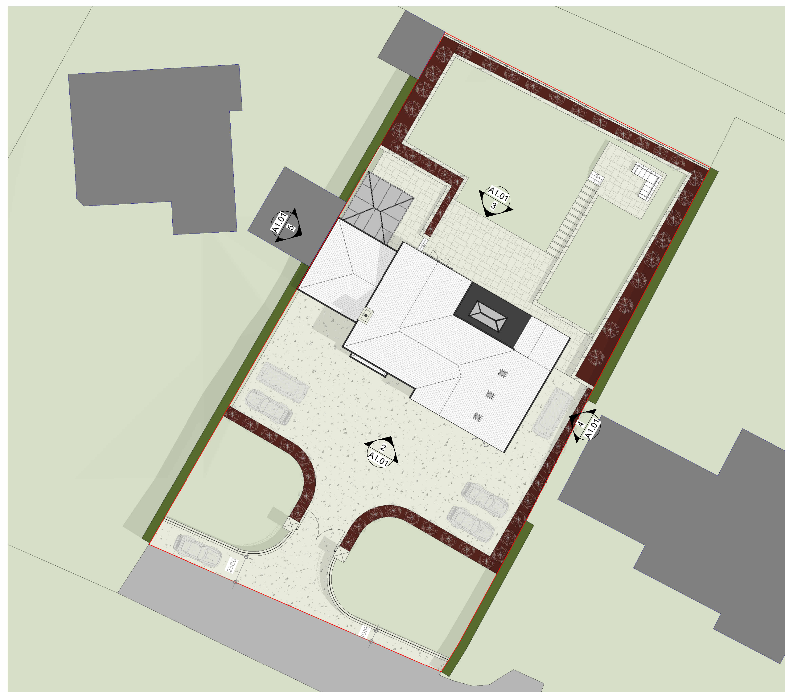
1 Level 03 - Proposed Site Plan 1:200