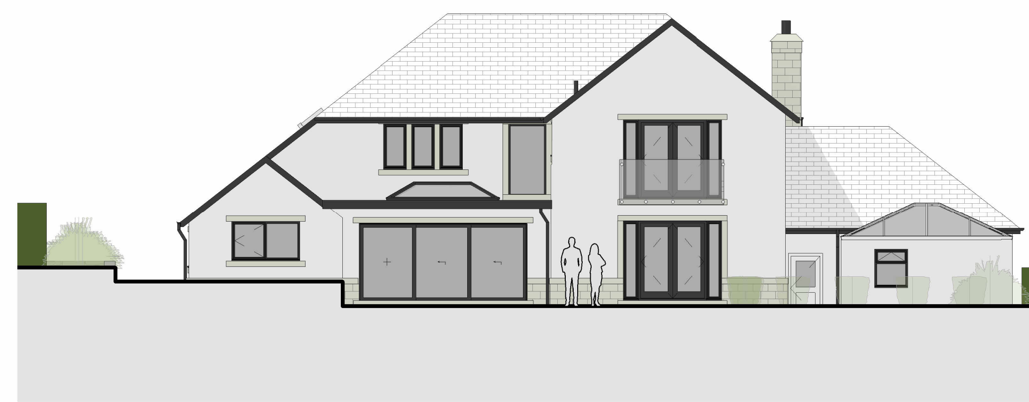
3 North East Elevation - Proposed 1:100