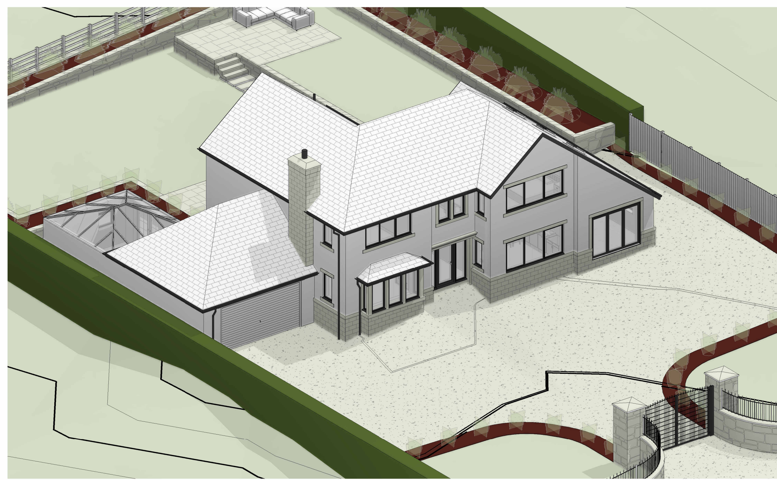
6 Proposed Ortho (Front) 1:200