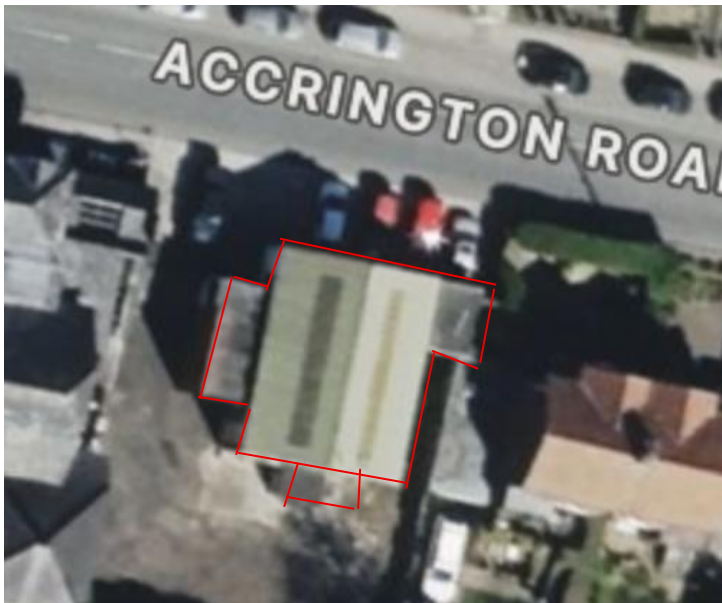
Roof plan of building to be removed.