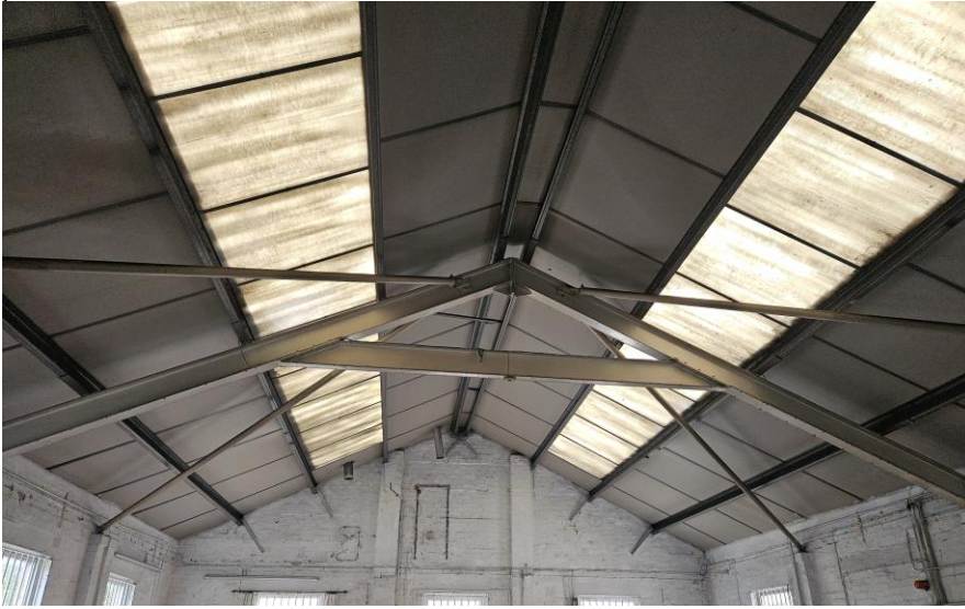
East flat roof section internal

Main roof void Steel structure with insulation cut tight between the structure. Clear panels to allow light. The structure was examined from the ground with Binoculars. The structure did not provide any potential for bats to roost.