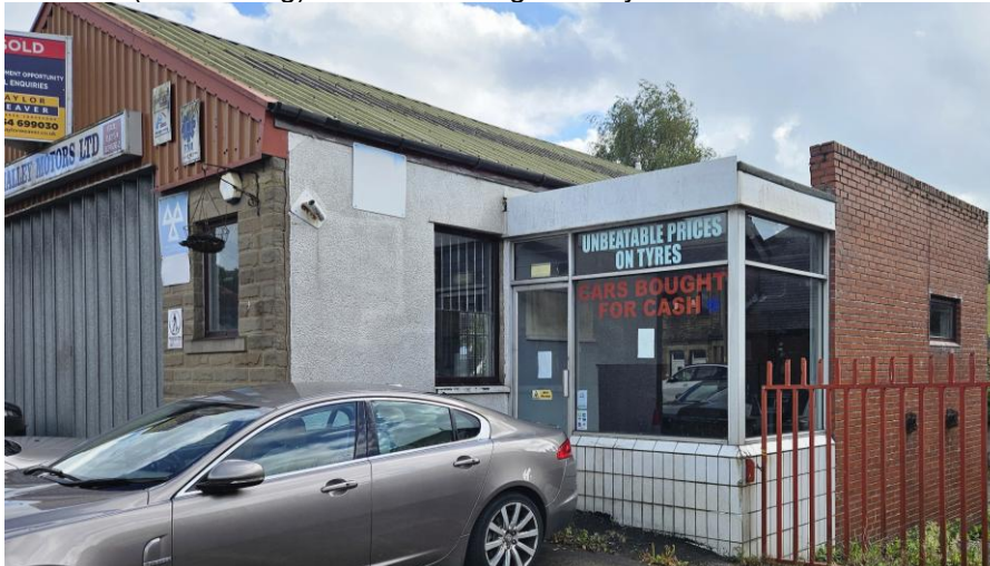
Part side (west) elevation