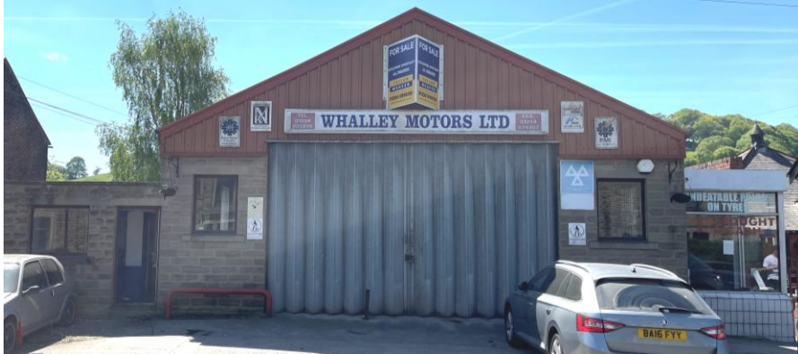
The front (north facing) elevation is single storey.

The main structure is a steel portal frame with a flat roof extension to each side elevation.