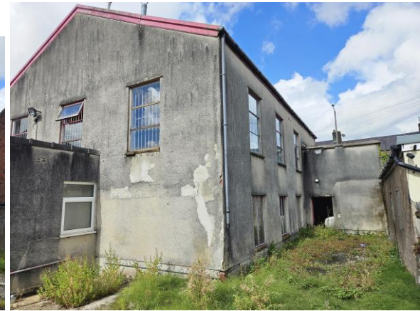
Rear and part side (East) elevation.