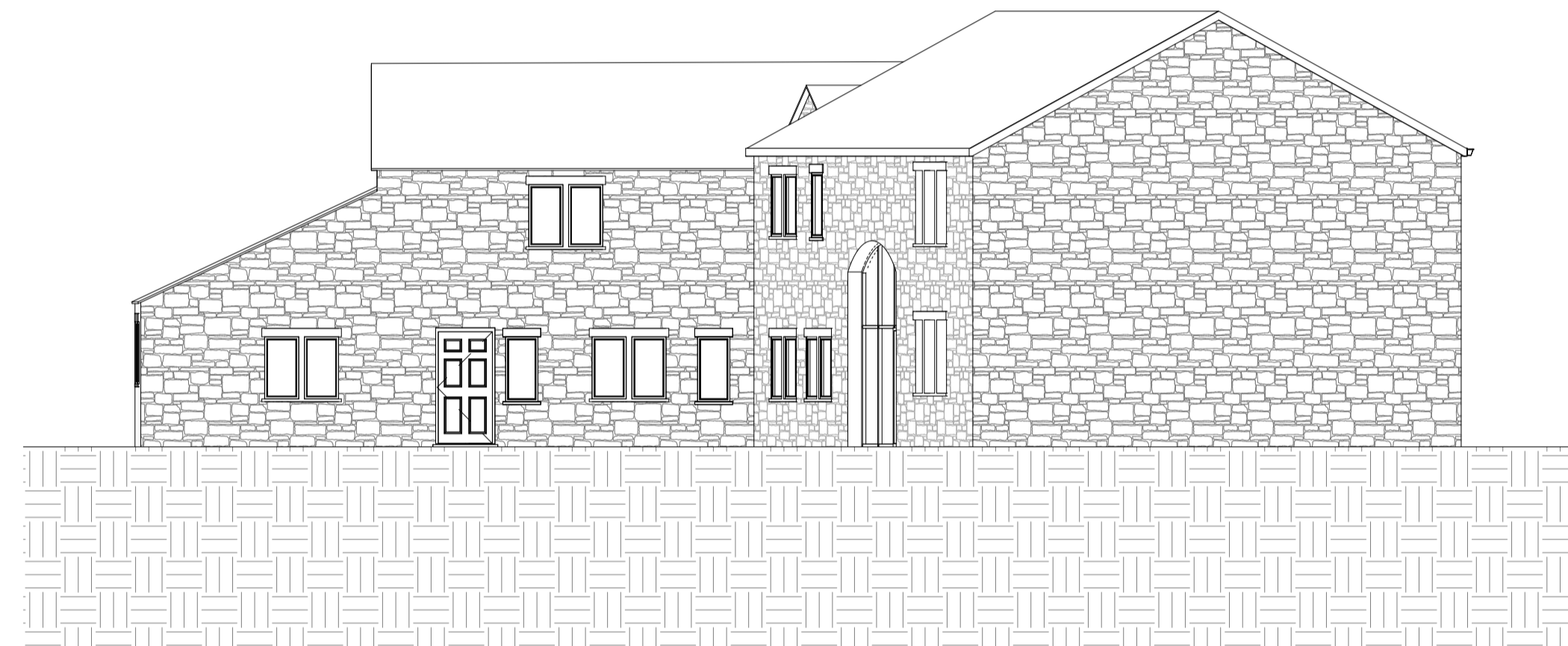
4 Elevation SOUTH 1 : 100