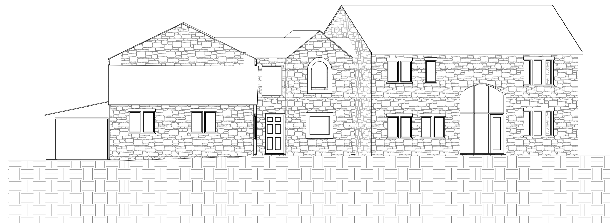
5 Elevation WEST 1 : 100