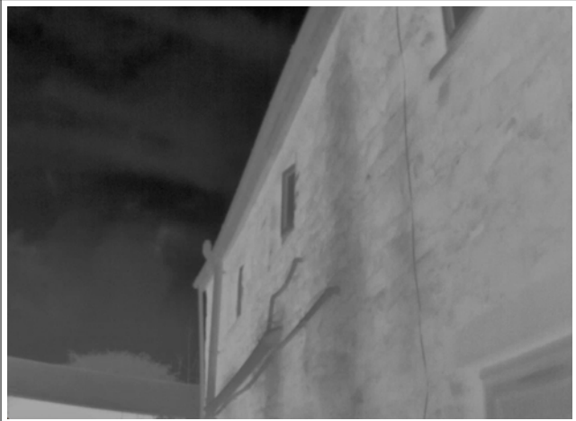
Thermal camera coverage