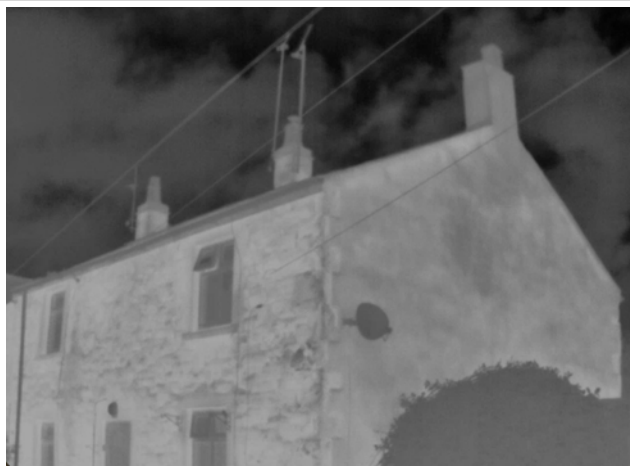
Thermal camera coverage

No bats were observed to emerge from the building.