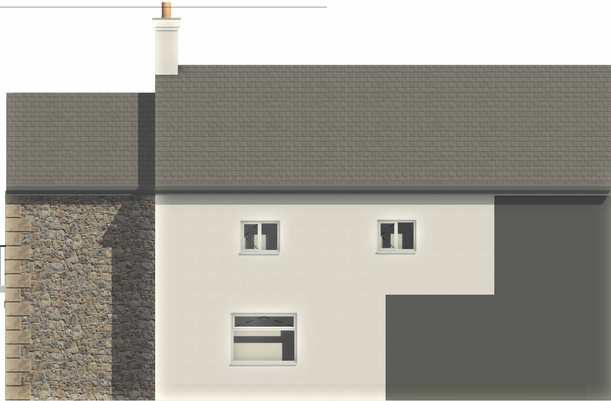
4 PROPOSED NORTH 1 : 50