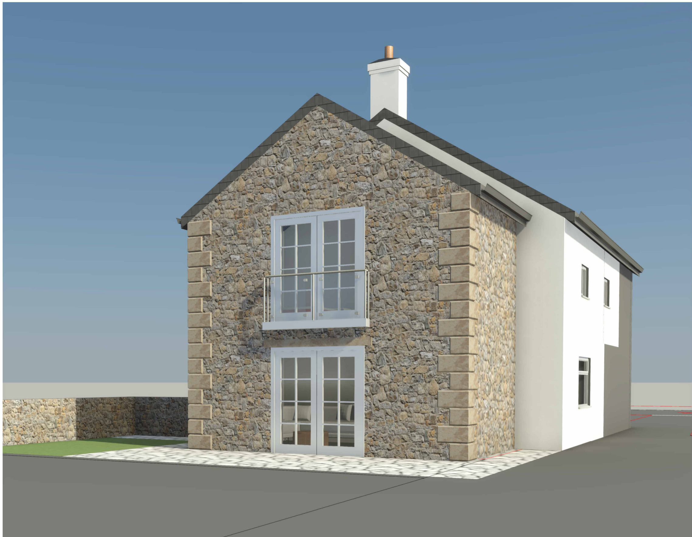
1 3D View 4