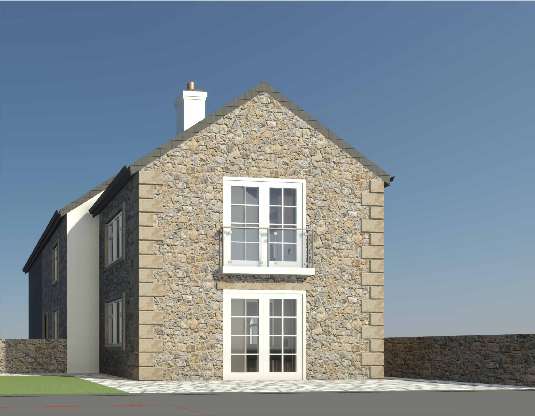
2 3D View 5