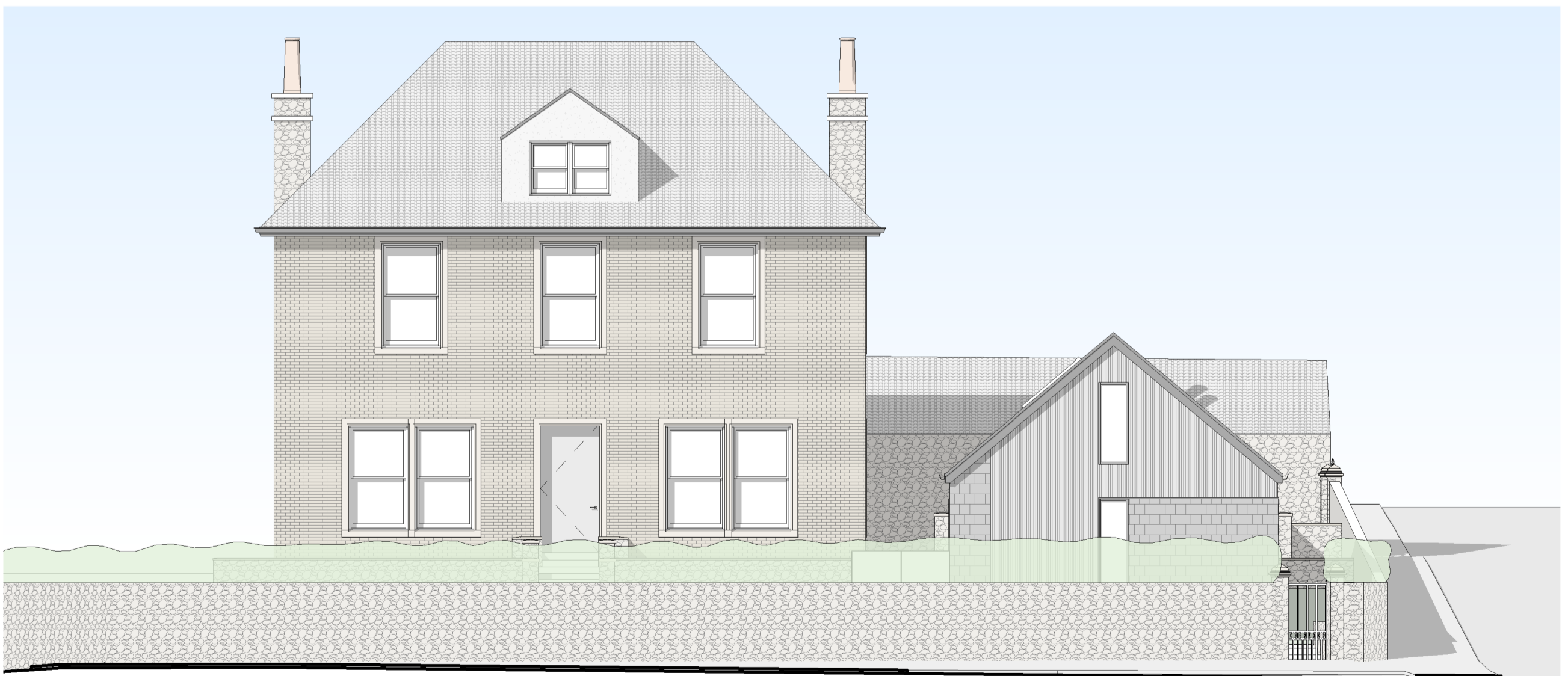
5 Proposed South Elevation - Street Scene 1:100