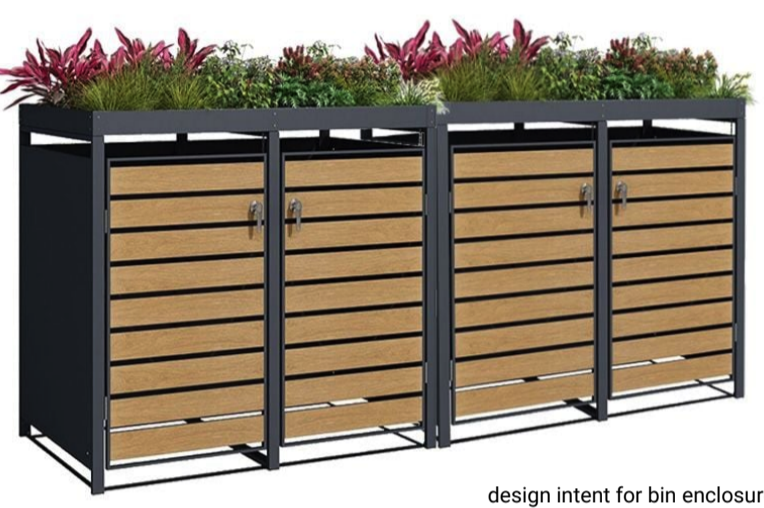
design intent for bin enclosure. Sedum roof or similar.