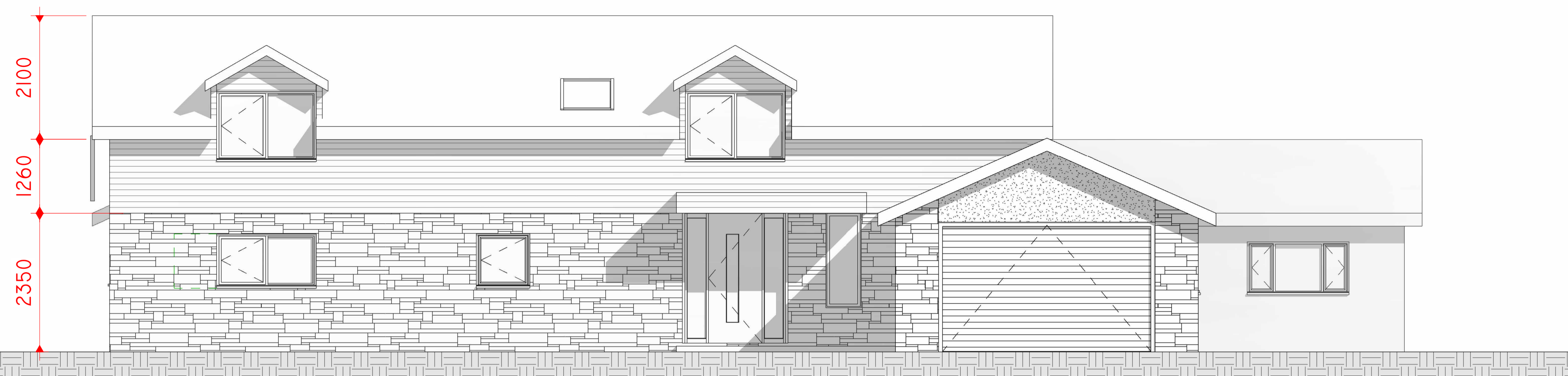
3 PROPOSED NORTH 1 : 50