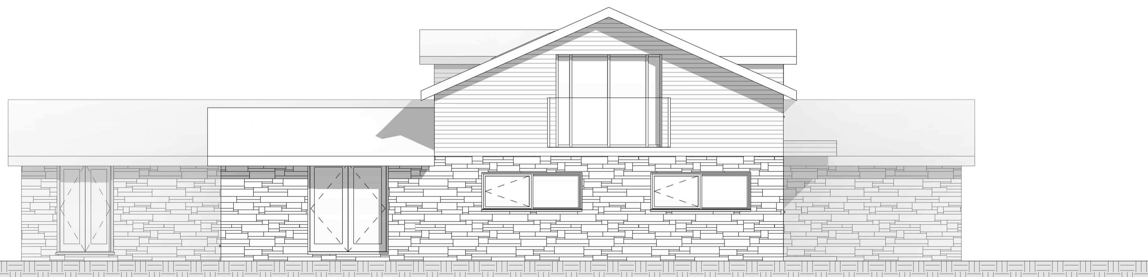
4 PROPOSED EAST. 1 : 50