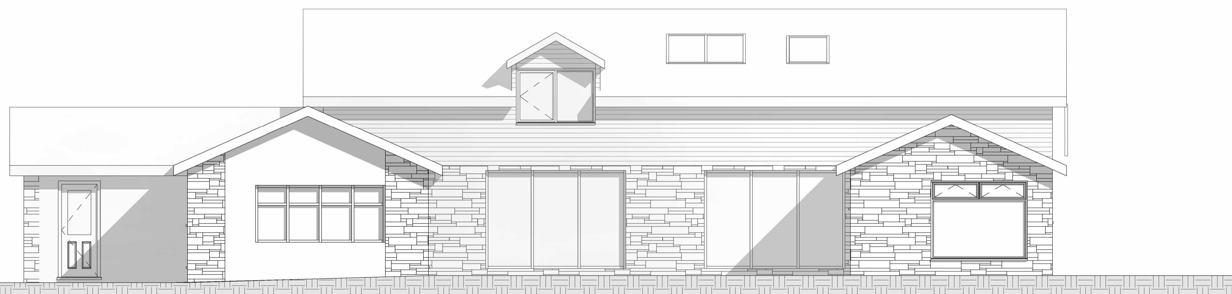
2 PROPOSED SOUTH 1 : 50