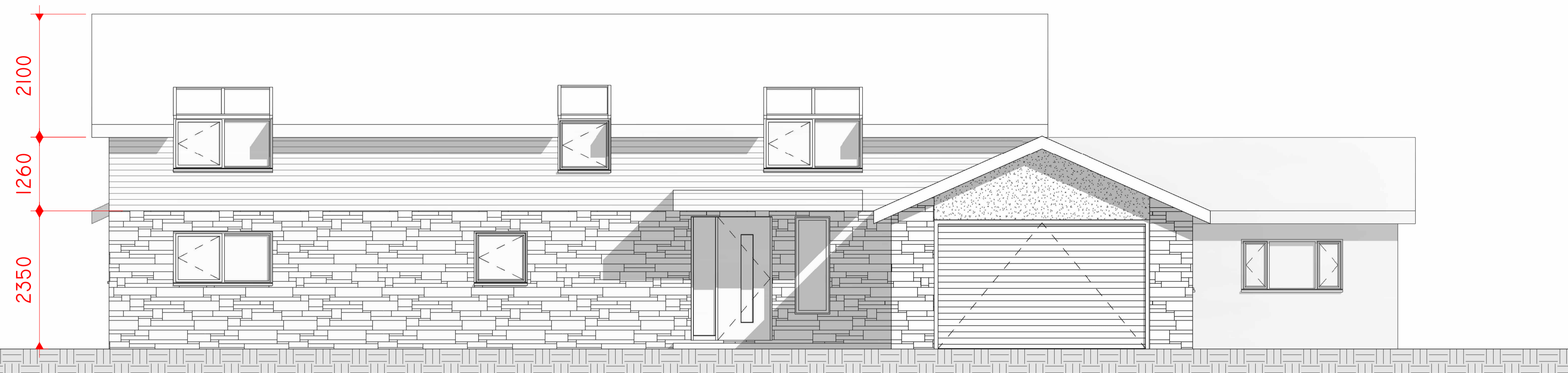
3 PROPOSED NORTH 1 : 50