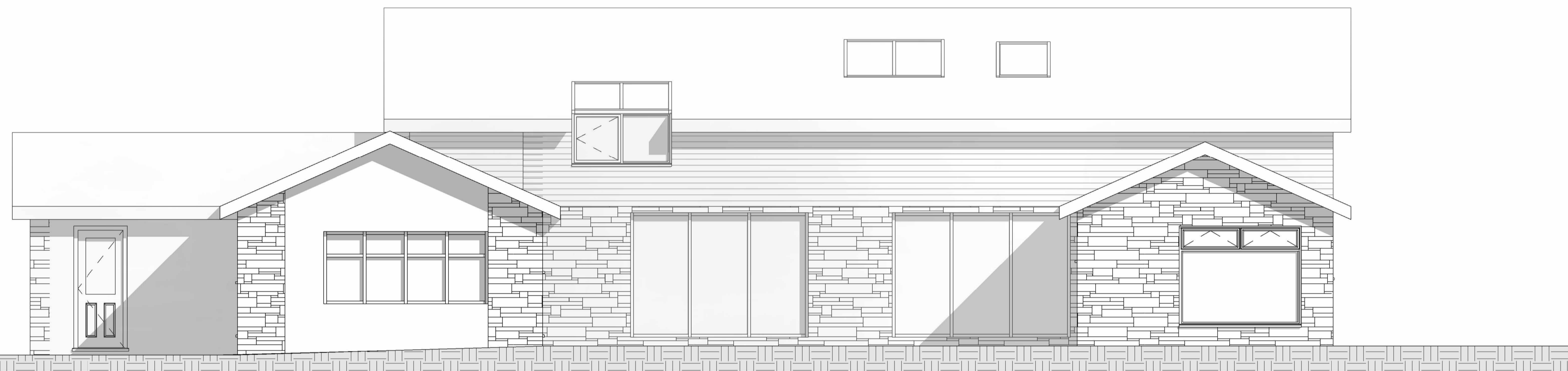
2 PROPOSED SOUTH 1 : 50