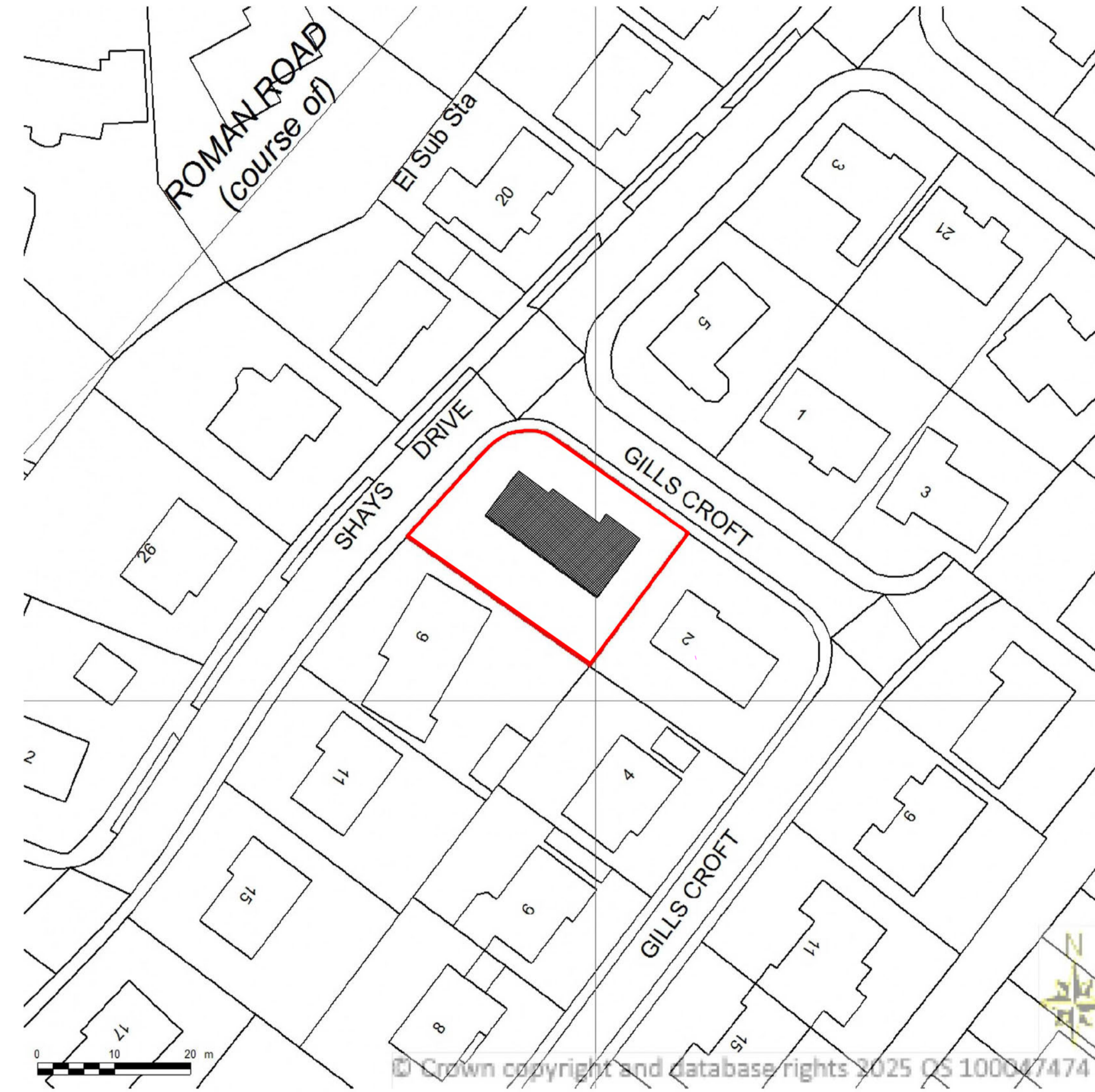
2 Block Plan Proposed 1:500