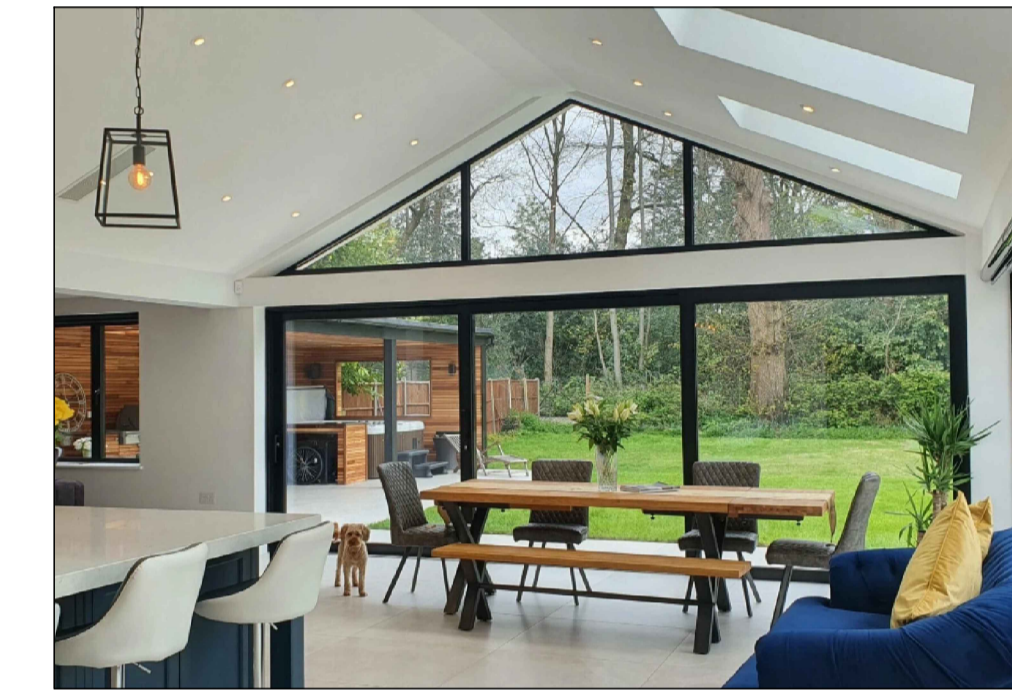
vaulted ceilings with velux roof windows