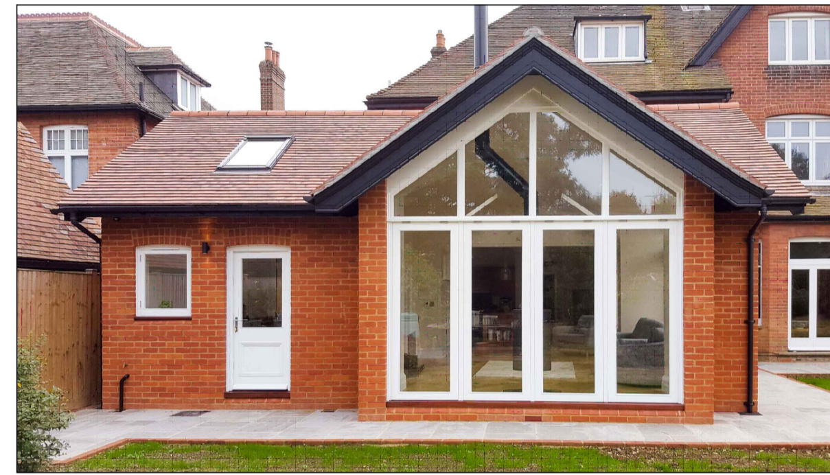
combination glazed gable with mono pitch roof