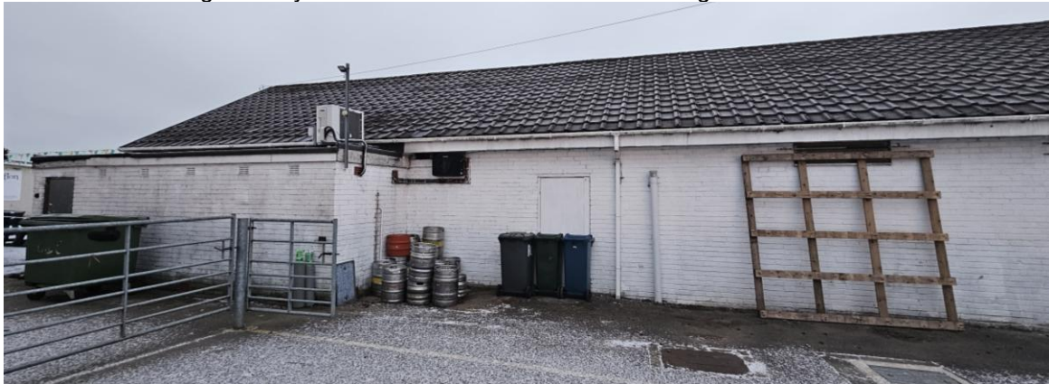
South rear Elevation

The building is a detached single storey Clubhouse for the Cricket club. possibly dating from the 1960 /70s. There is a single storey lean- to extension at the rear housing the cellar.