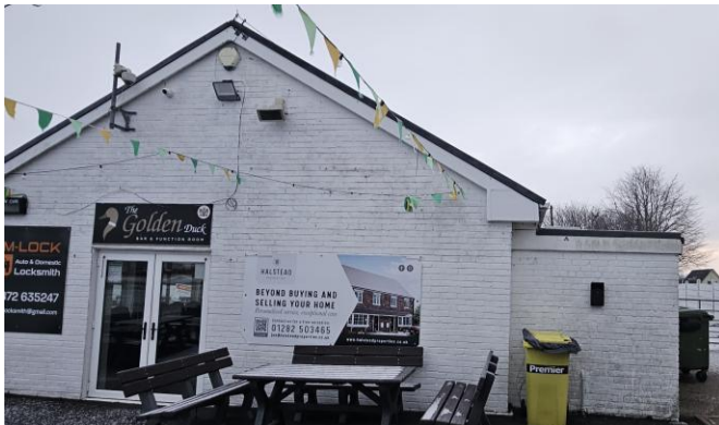
West side Elevation