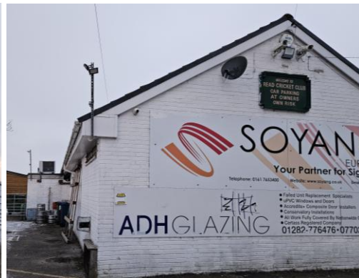
East side Elevation