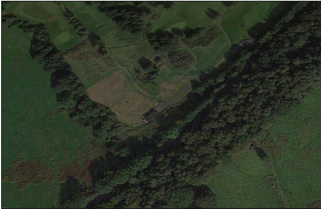
A1- Aerial imagery of the site, August 2021