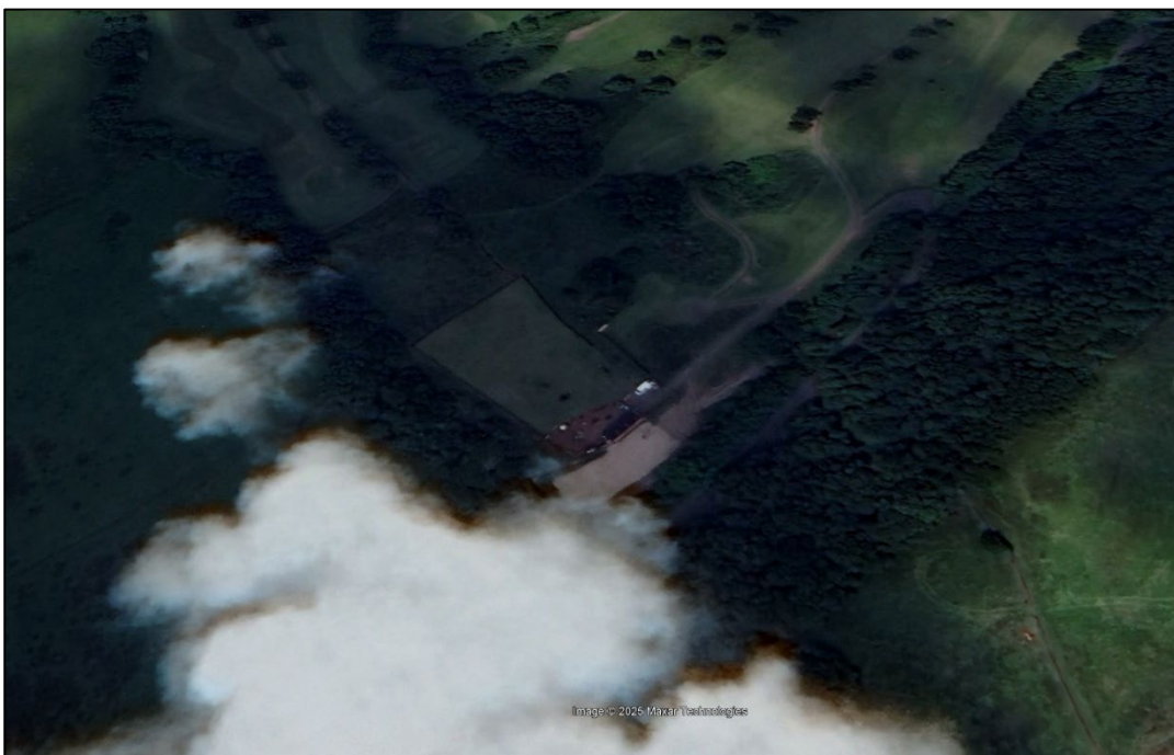
A2- Aerial imagery of the site, June 2022