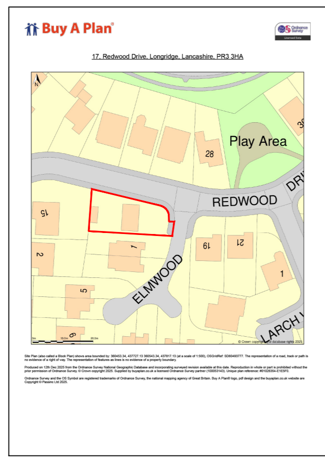
Location Plan 1:1250 Scale