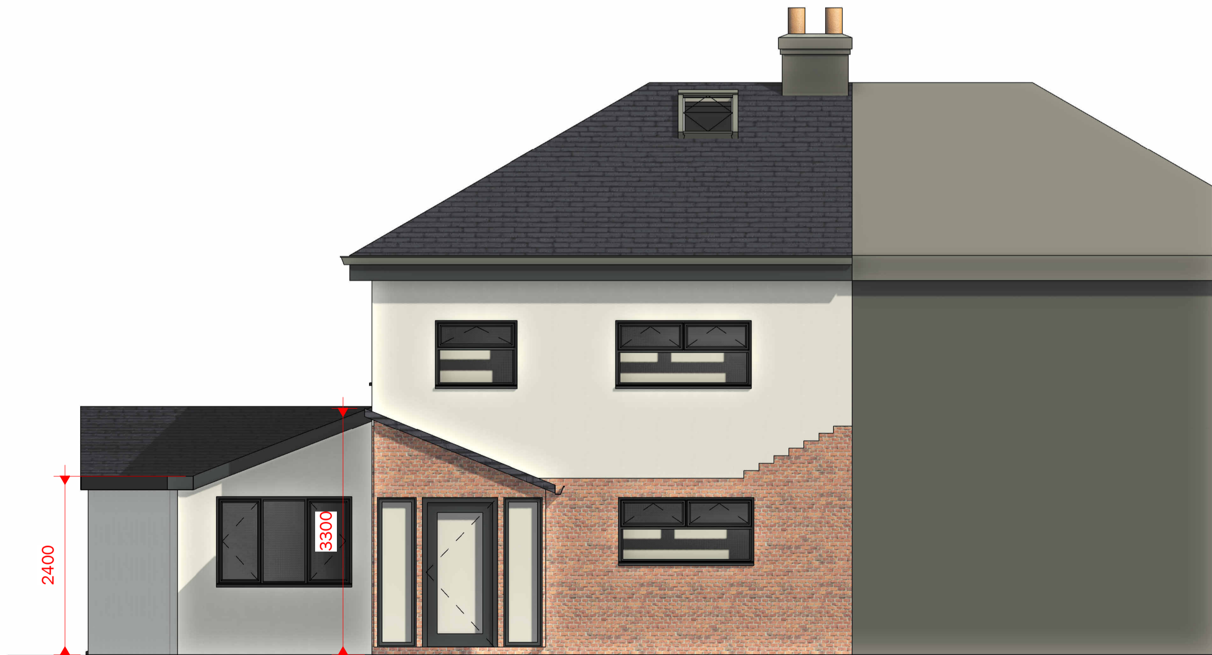
3 PROPOSED SOUTH 1 : 50