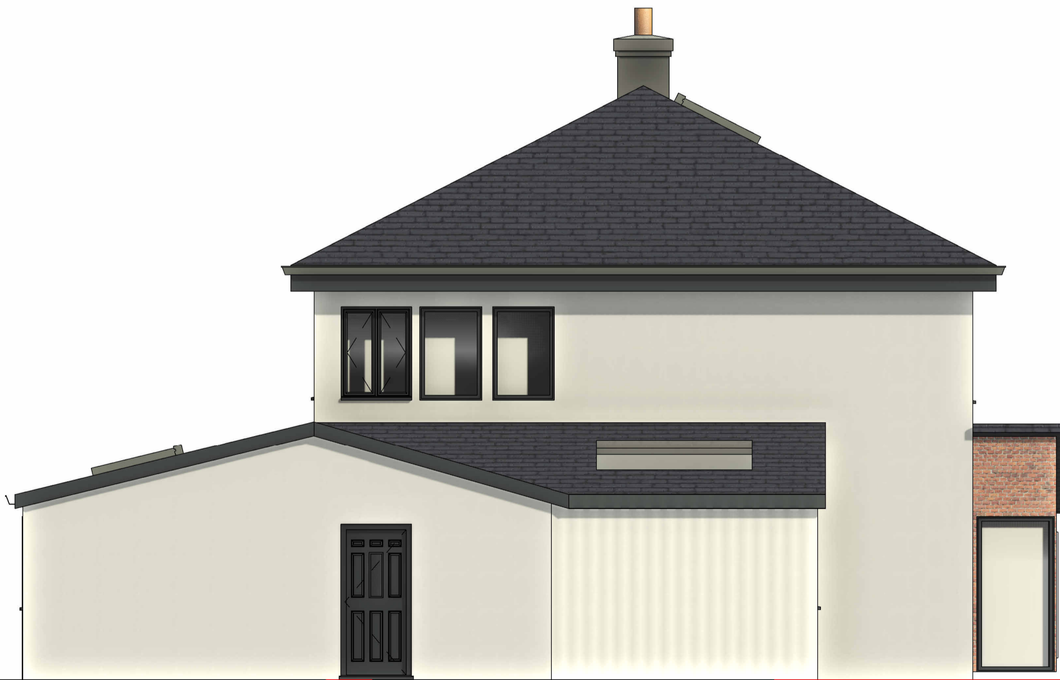
4 PROPOSED WEST 1 : 50