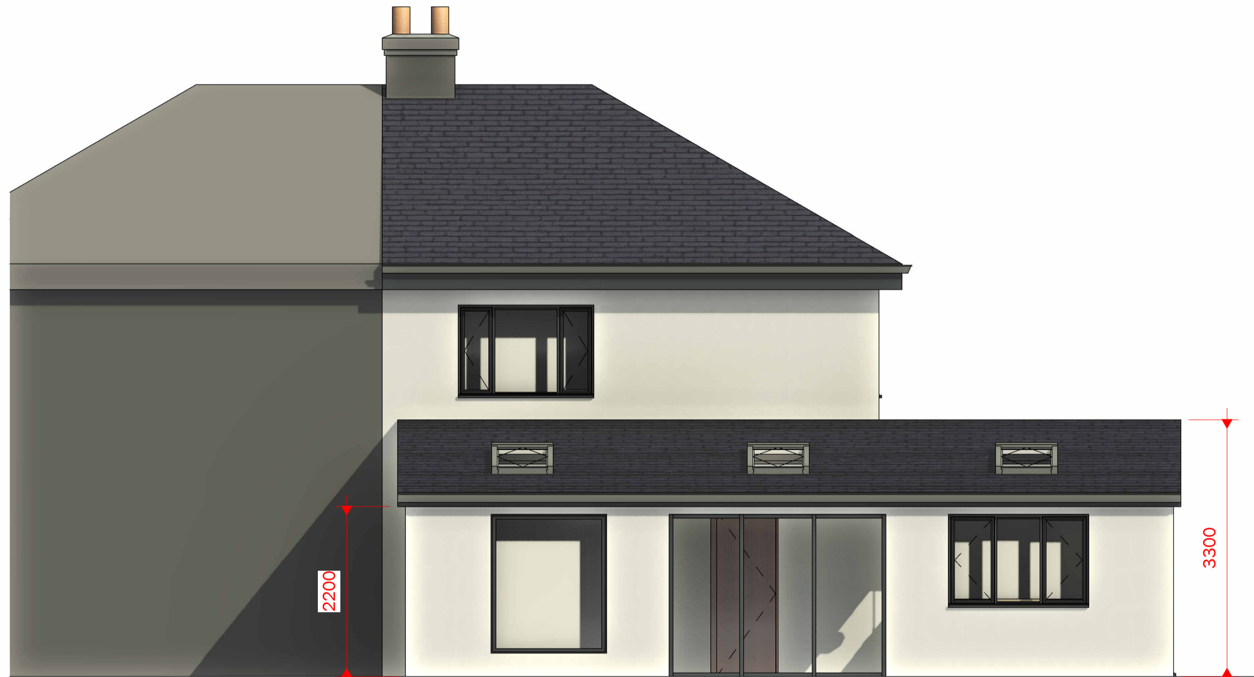
2 PROPOSED NORTH 1 : 50