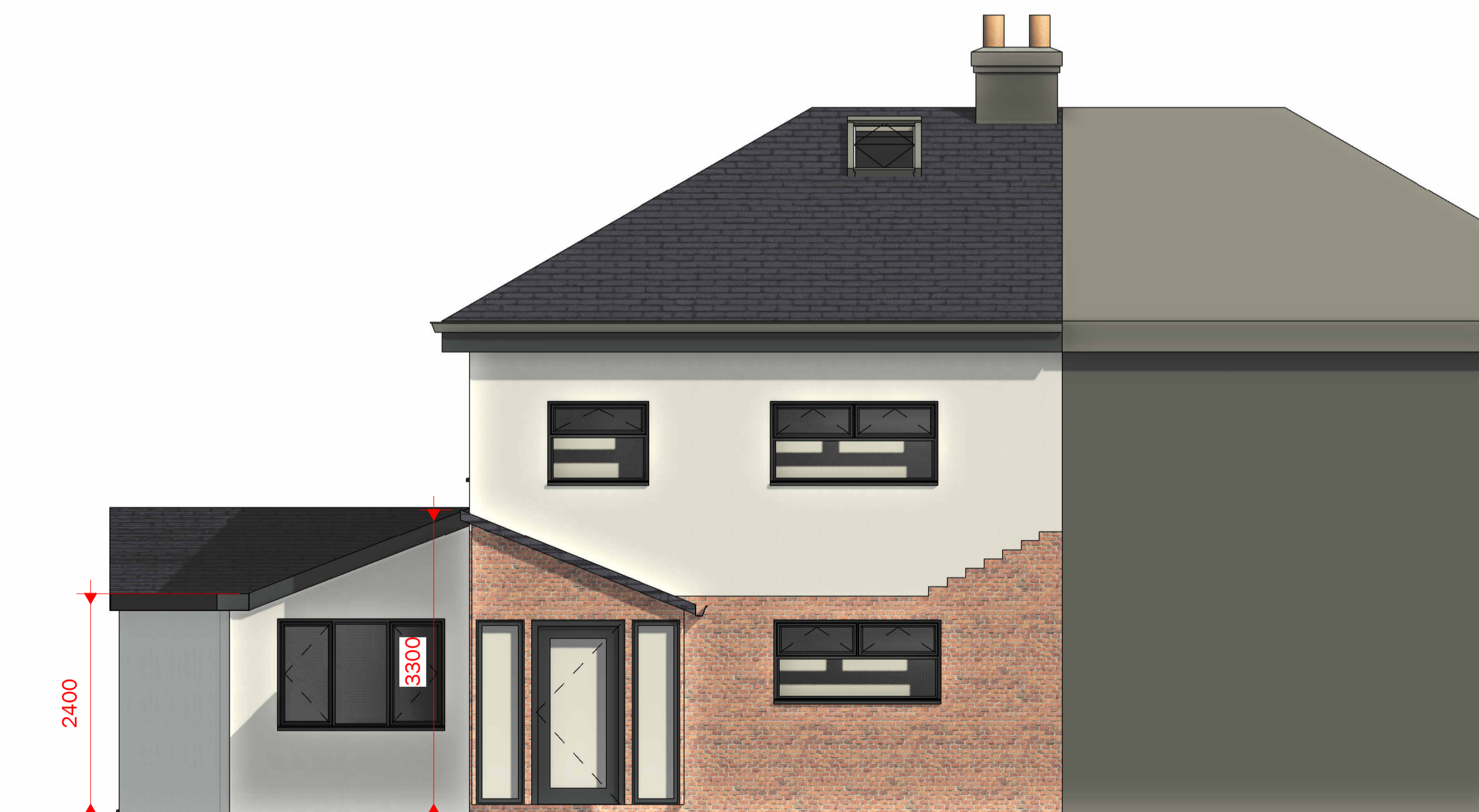
3 PROPOSED SOUTH 1 : 50