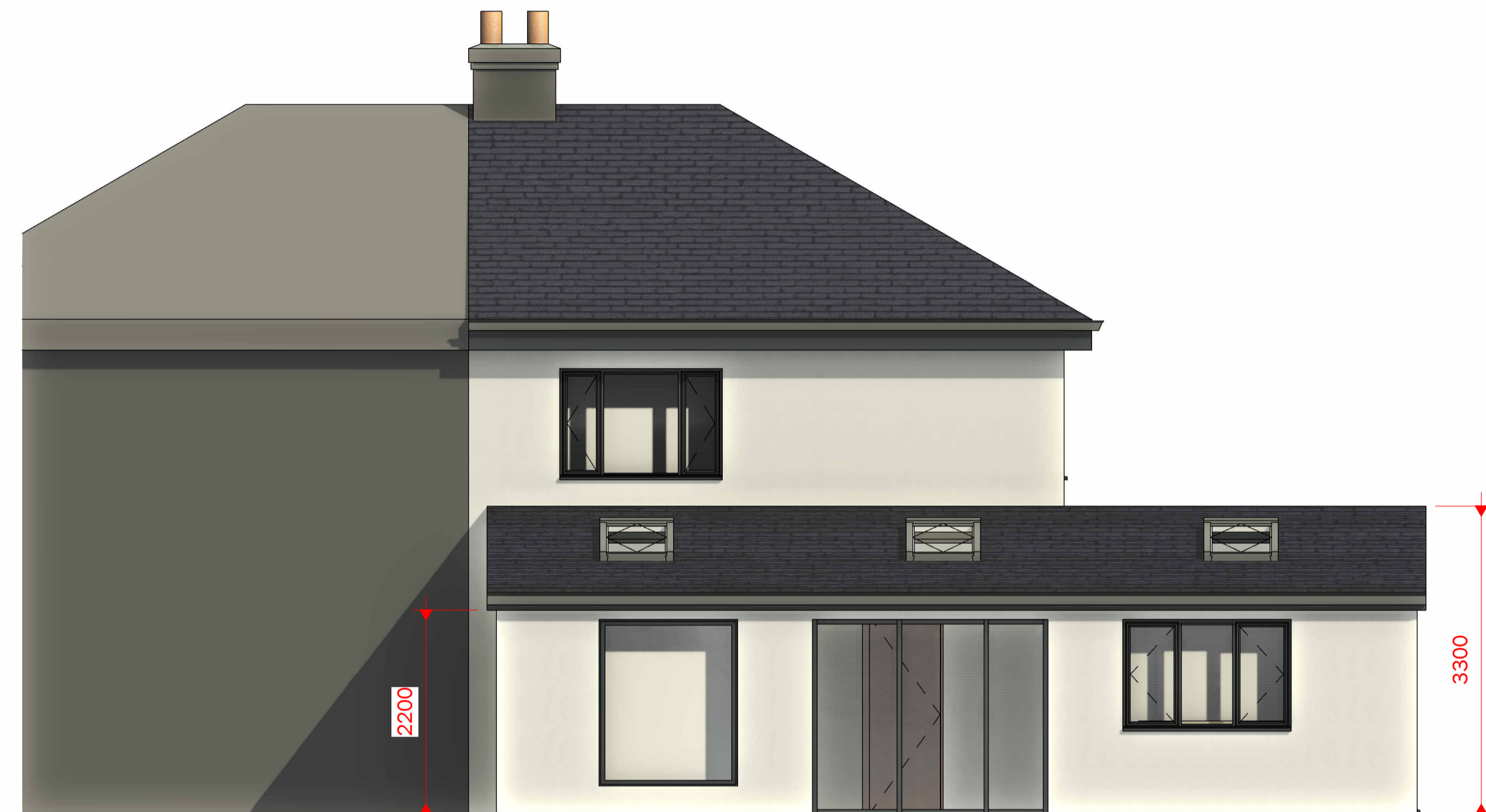
2 PROPOSED NORTH 1 : 50