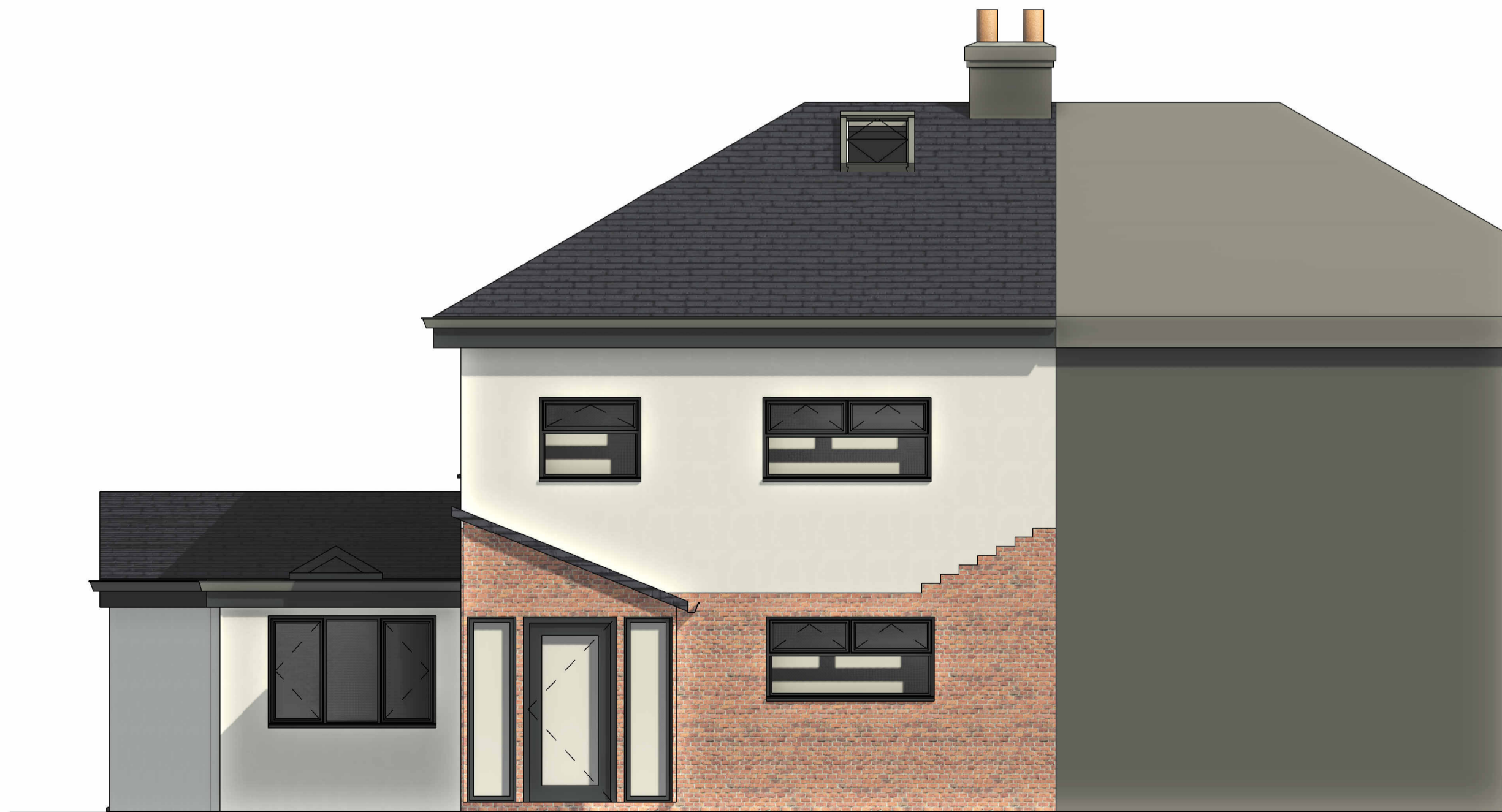
3 PROPOSED SOUTH 1 : 50