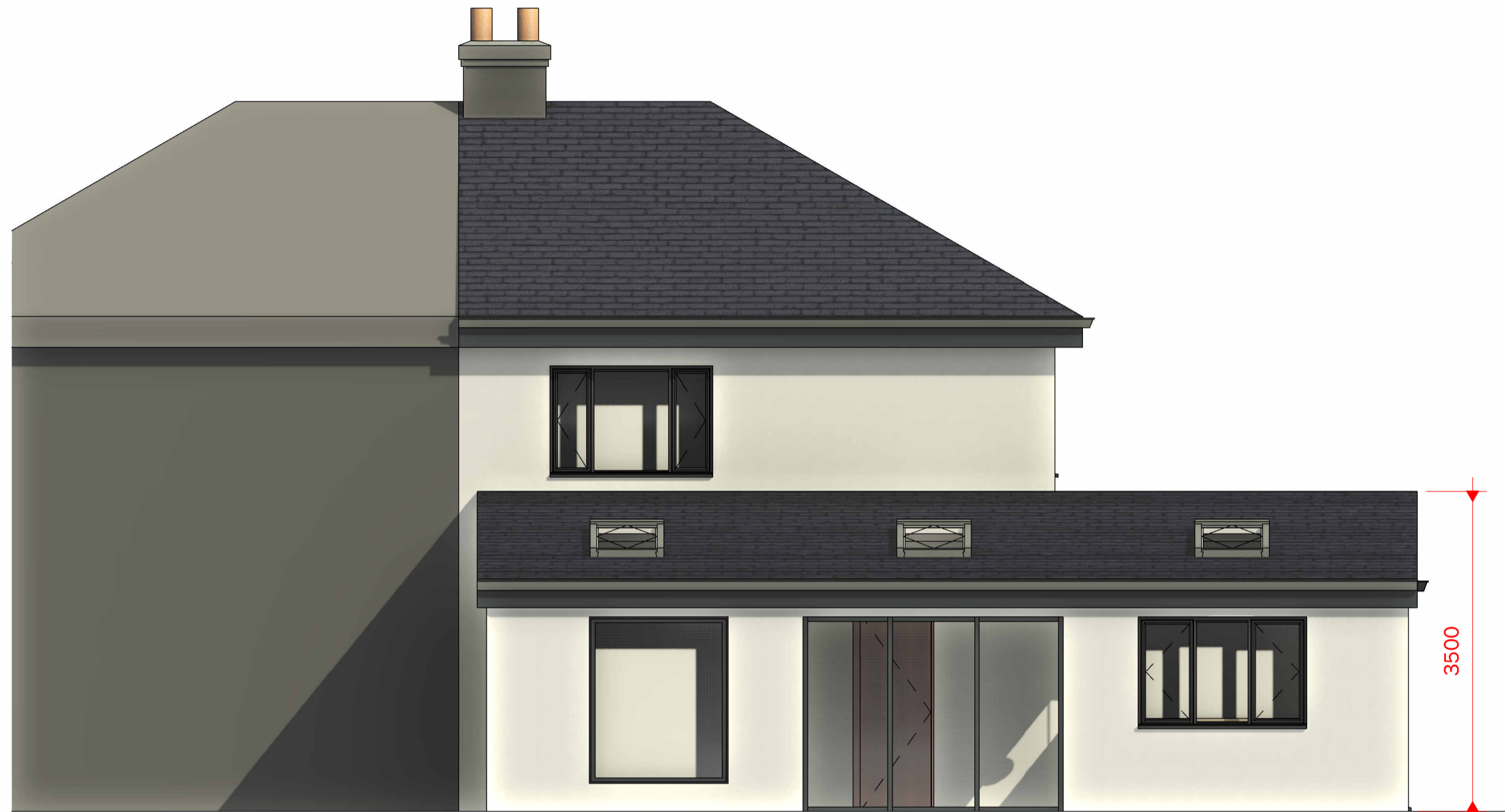
2 PROPOSED NORTH 1 : 50