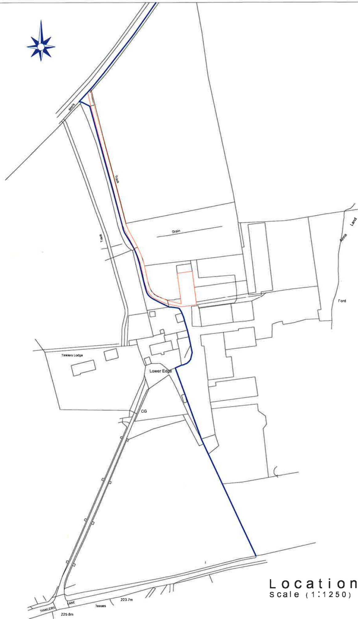
Location Plan Scale (1:1250)