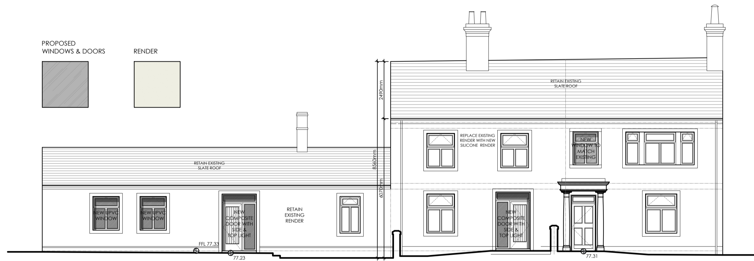
PROPOSED FRONT (NORTH WEST) ELEVATION Scale 1:100