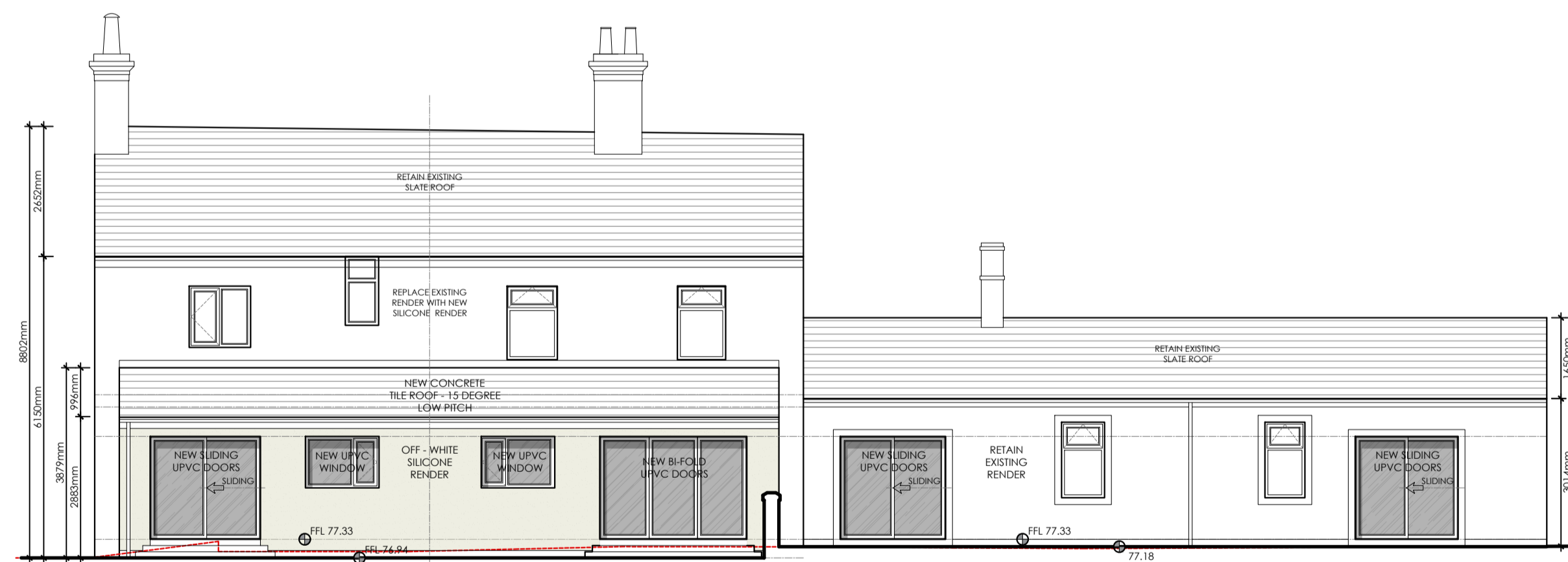
PROPOSED REAR (SOUTH EAST) ELEVATION Scale 1:100

REVISIONS: Rev B - New Entrance door revised to Unit 2. - 02.03.2026 - CH Rev A - Materials Added. - 28.11.2025 - TDM