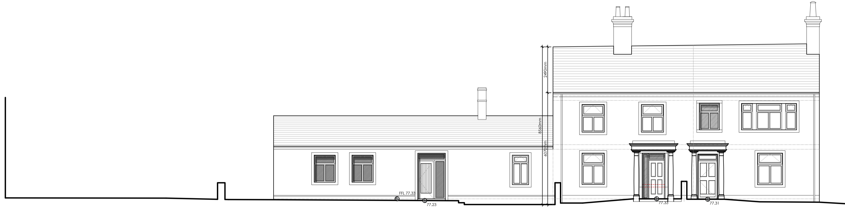
PROPOSED SITE SECTION A Scale 1:100

87.00 86.00 85.00 84.00 83.00 82.00 81.00 80.00 79.00 78.00 77.00 76.00 75.00