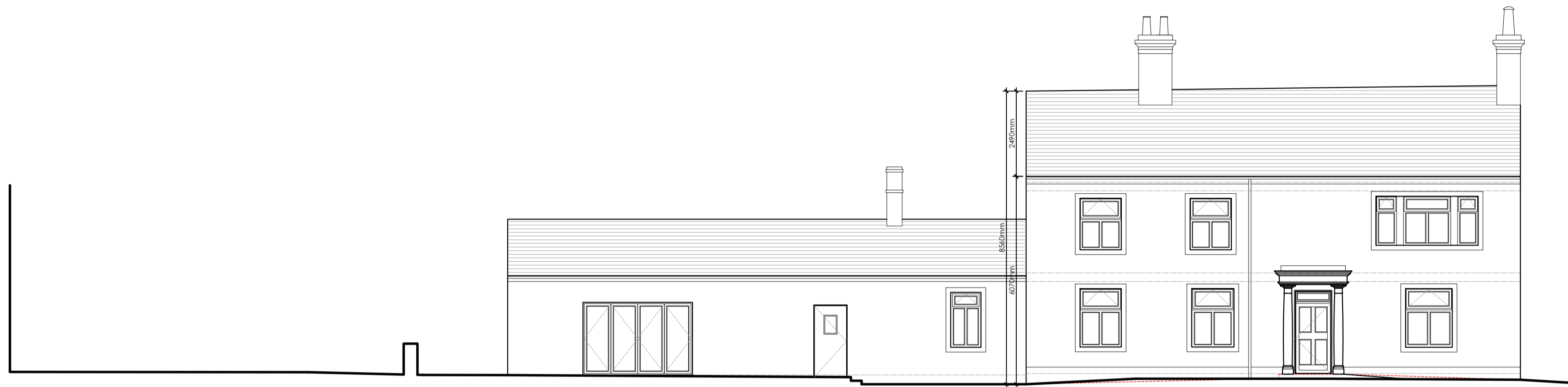
EXISTING SITE SECTION A Scale 1:100

87.00 86.00 85.00 84.00 83.00 82.00 81.00 80.00 79.00 78.00 77.00 76.00 75.00