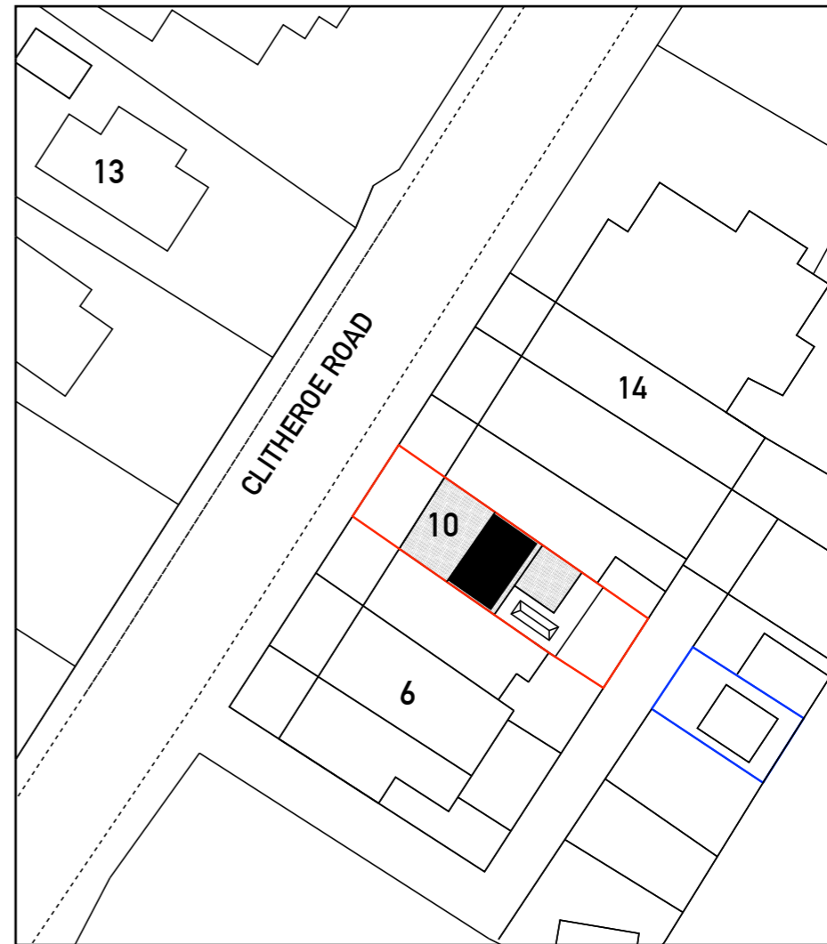
1:500 PROPOSED BLOCK PLAN