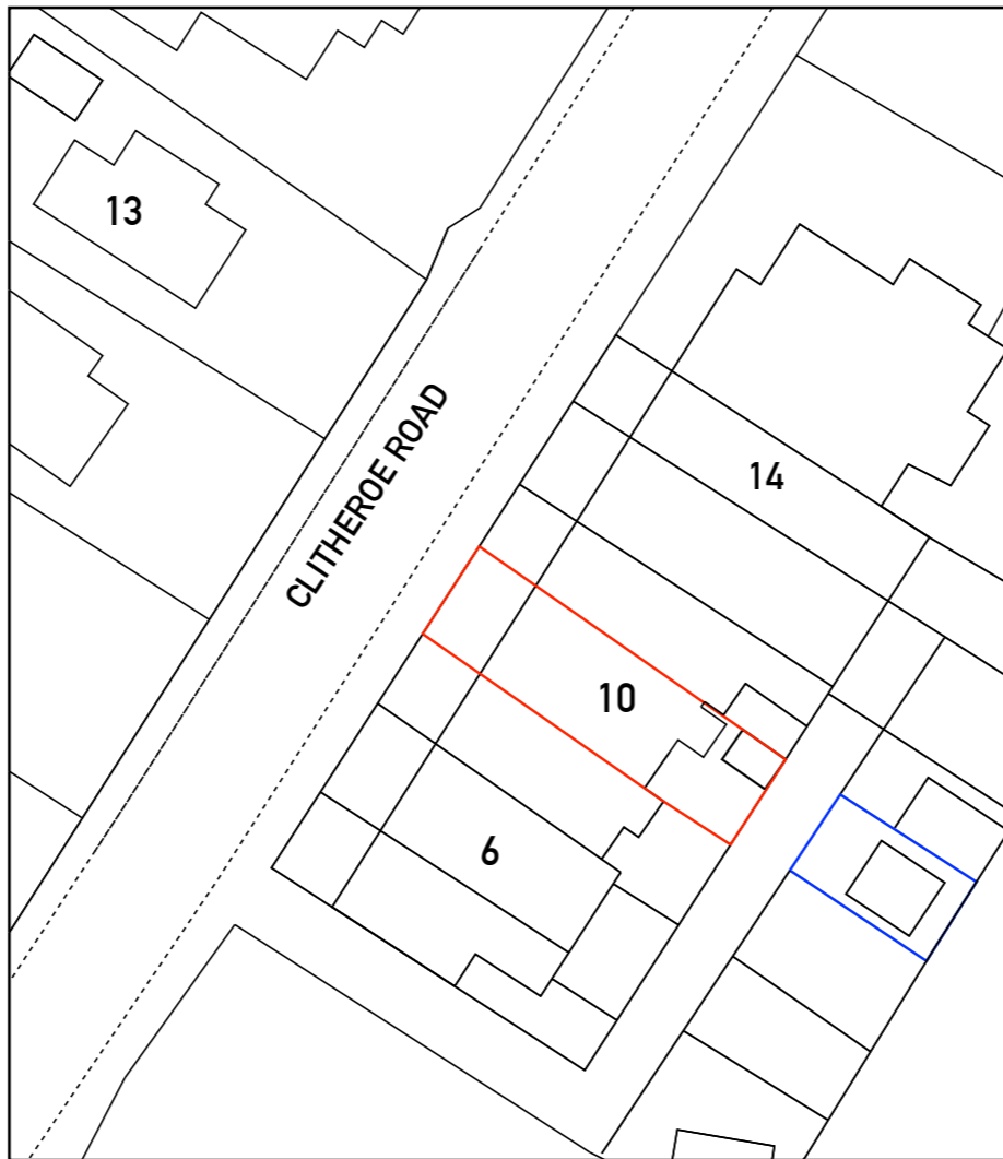
1:500 EXISTING BLOCK PLAN