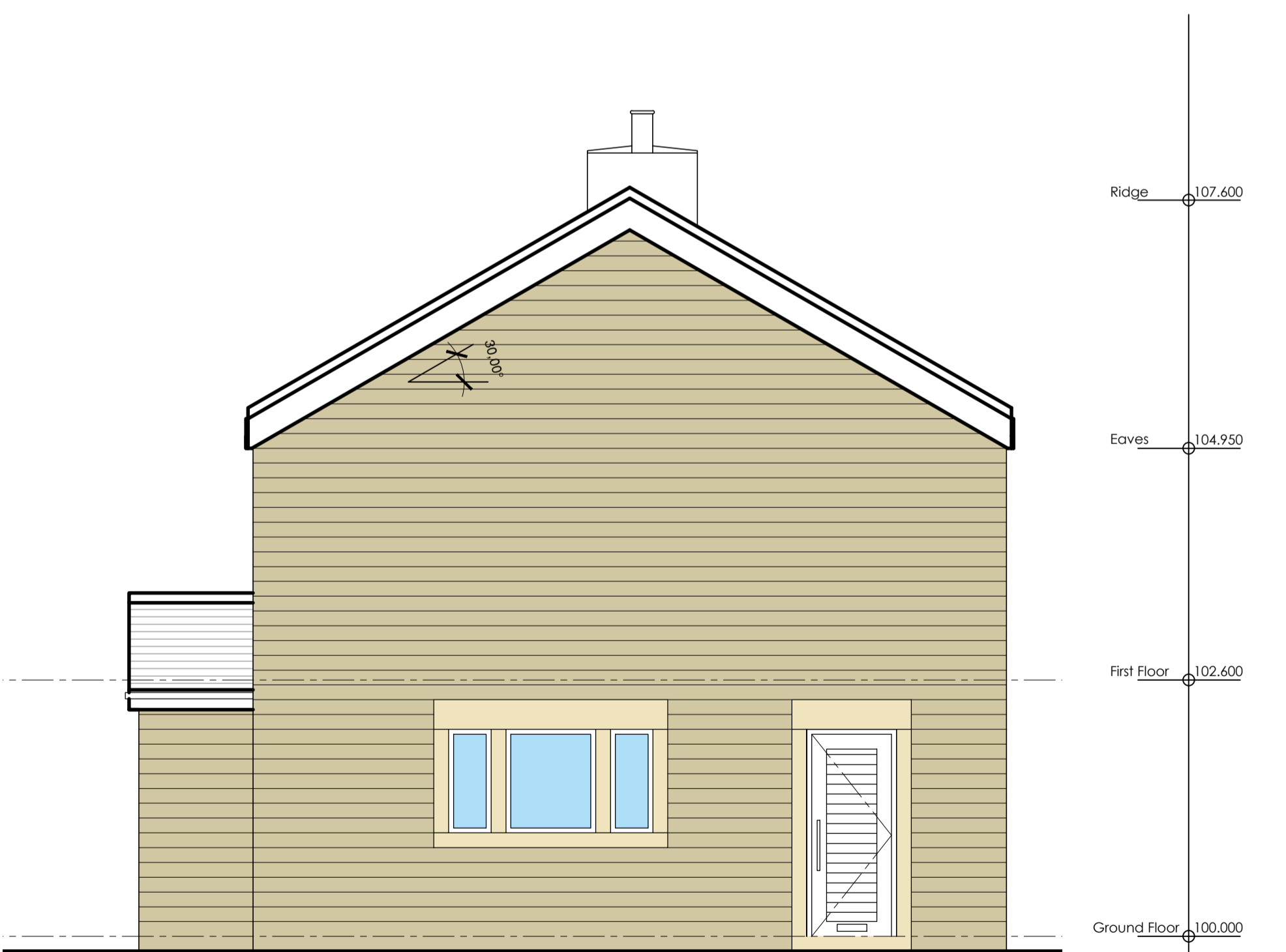
Proposed Elevation D Scale 1:50

2) All dimensions shown on this drawing are in meters/millimeters unless otherwise noted. 3) The contractor is to confirm all dimensions on site prior to commencing work and advise of any discrepancies immediately to the Architect. B. Updates following Planning comment - 11.02.2026 A. Updates following Planning Refusal - 10/2025