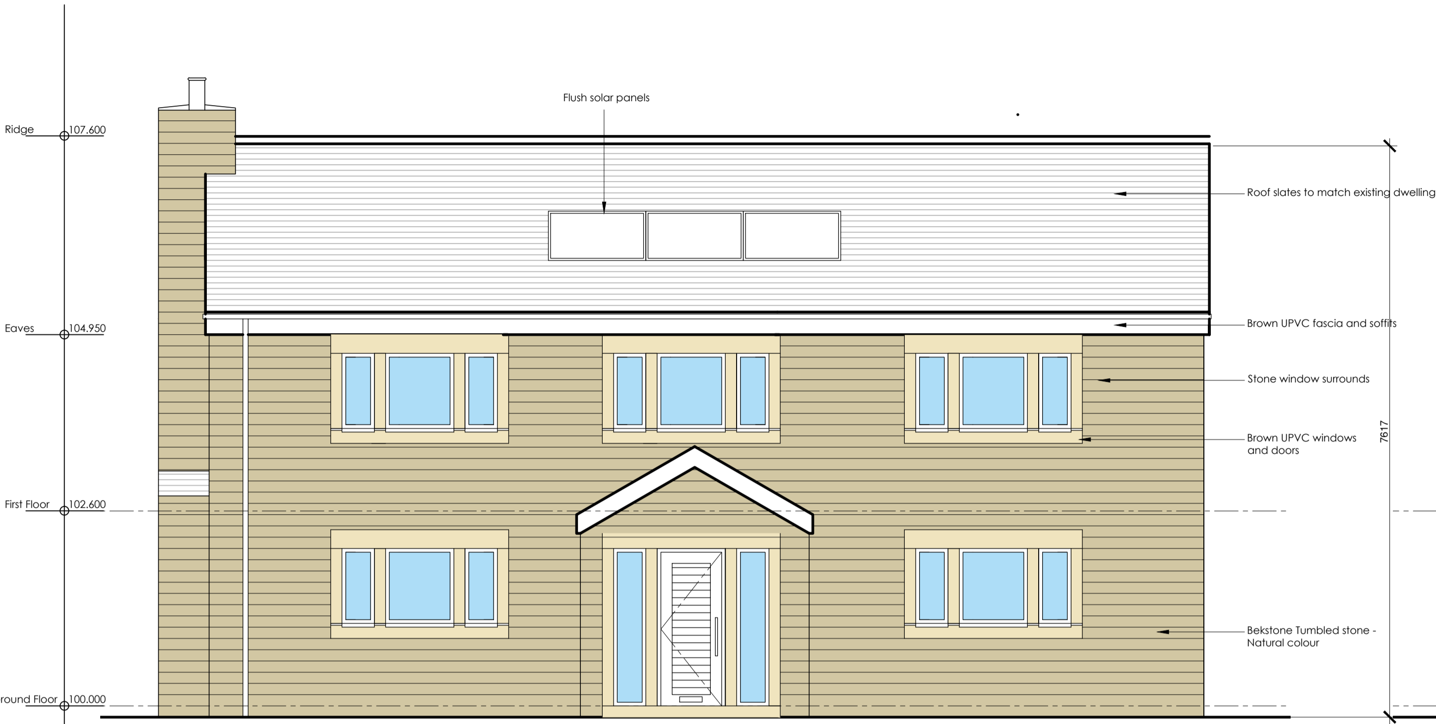
Proposed Elevation A Scale 1:50