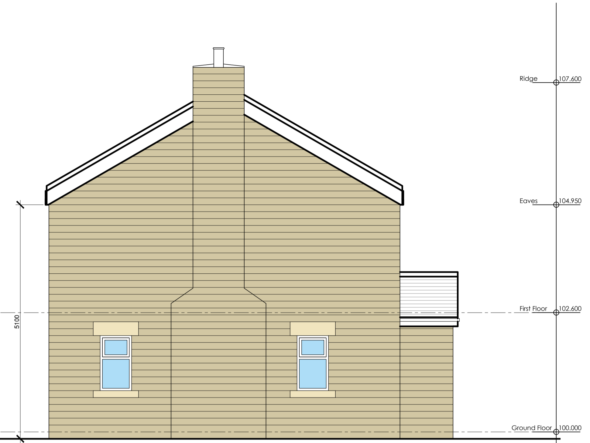
Proposed Elevation B Scale 1:50