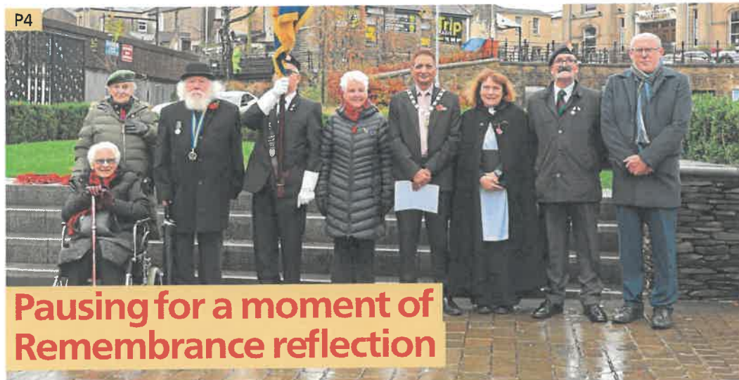
Pausing for a moment of Remembrance reflection