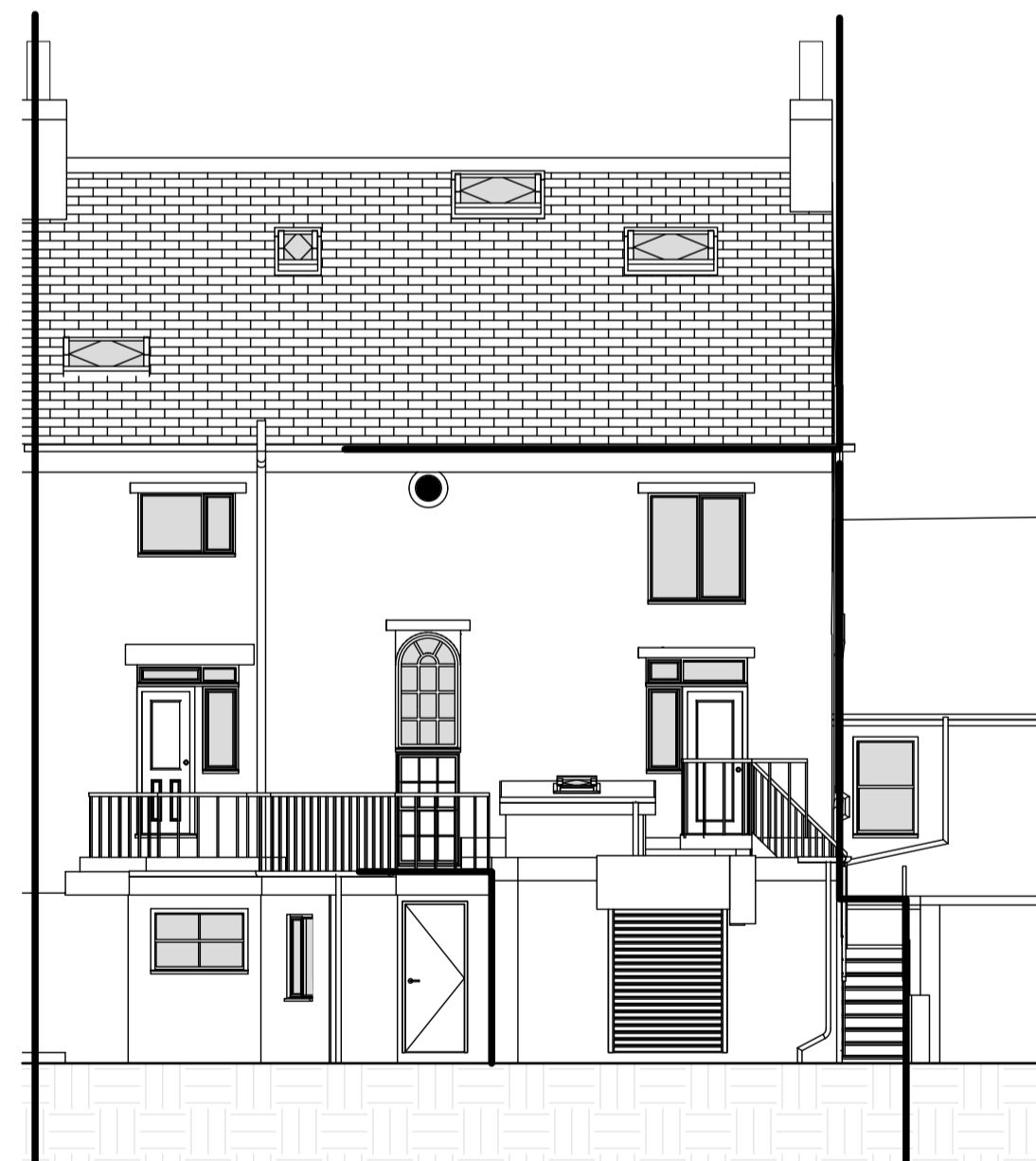
Existing West Elevation (Rear) 1:100 Scale