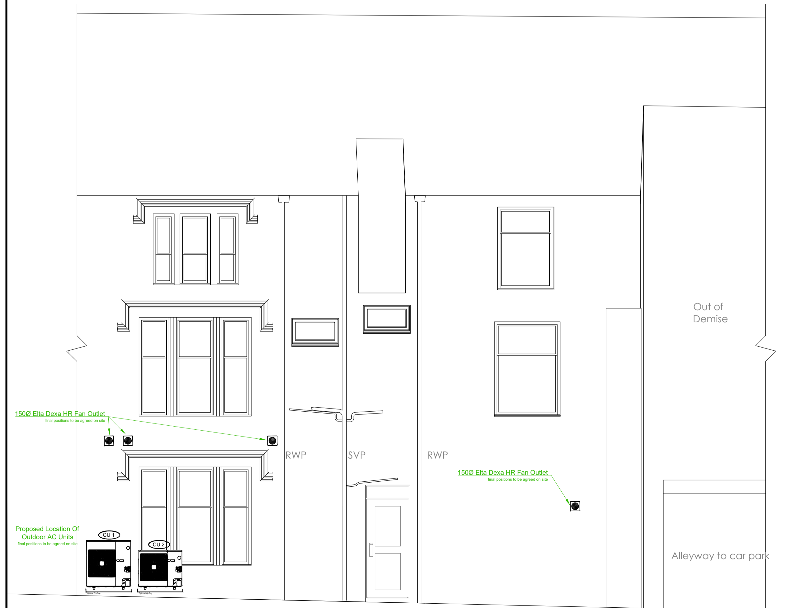
PROPOSED REAR ELEVATION SCALE 1:50 @A1