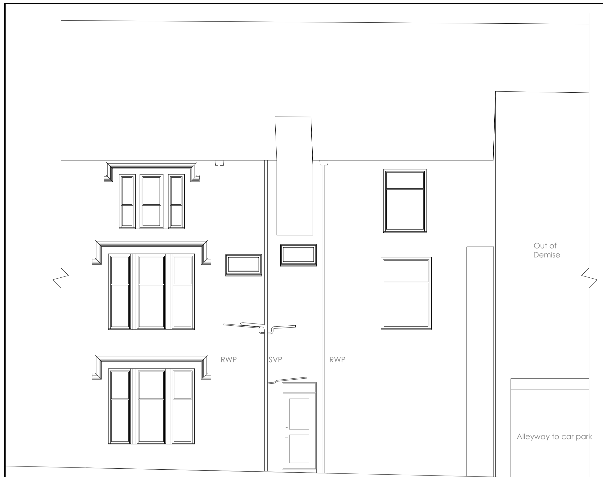
EXISTING REAR ELEVATION SCALE 1:50 @A1

do not scale from this drawing, all dimensions to be checked on site