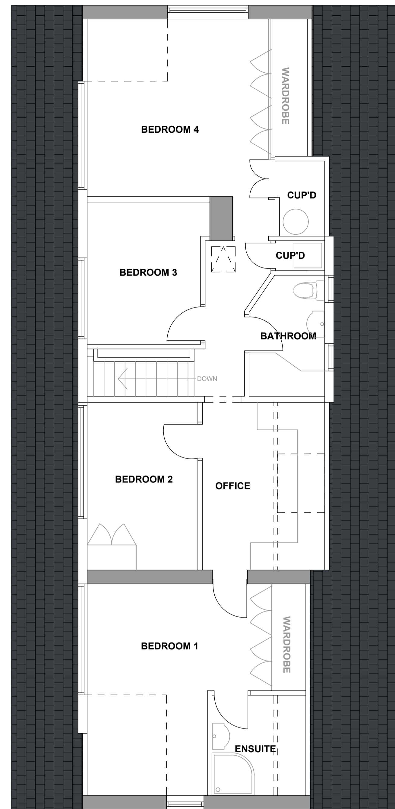
EXISTING FIRST FLOOR PLAN SCALE - 1:50 @ A1