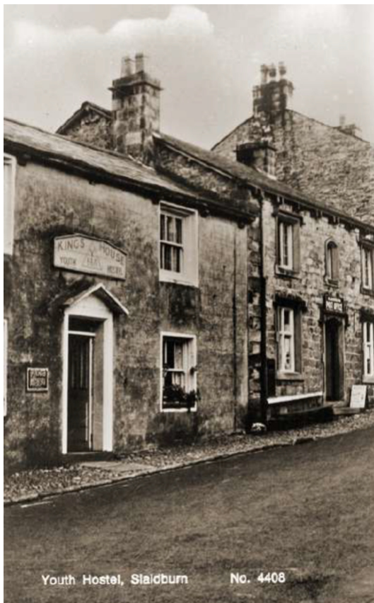
Photograph taken in late 1950's, showing the Post Office sign above 3 Church Street.

A planning application made by the tenant of the Hark To Bounty was lodged in 1996 to convert it to form accommodation for the Inn. The lease for the Hark To Bounty finished in October 2024 and since then, 3 Church Street has remained vacant.