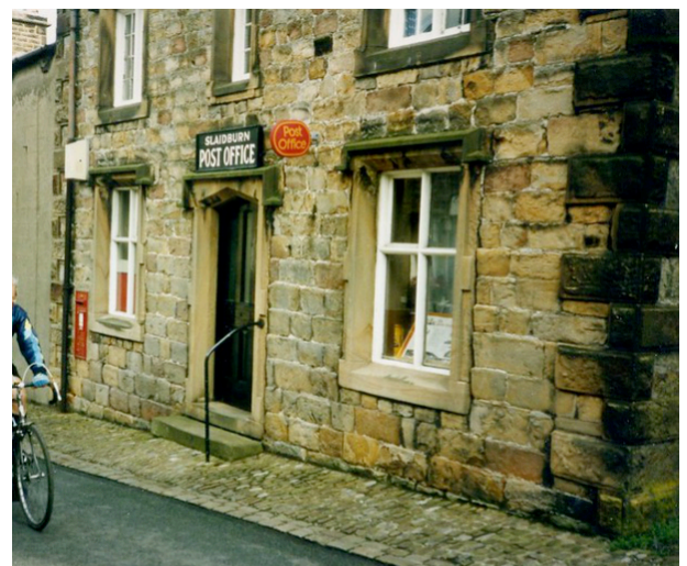
Photograph taken in 1994, showing the Post Office still operating at 3 Church Street.