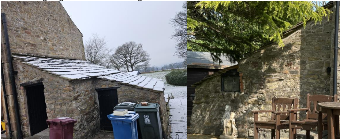
Front Southeast Elevation of stores

The stores are lean-to structures adjacent to the northeast gable elevation of a detached property. The timber garage is detached building.