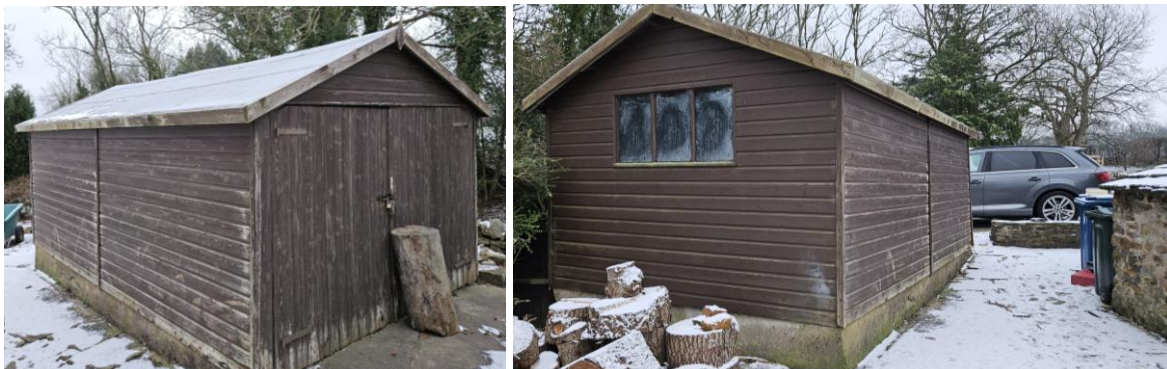
Front Southeast, side and rear northwest elevation of Timber garage.