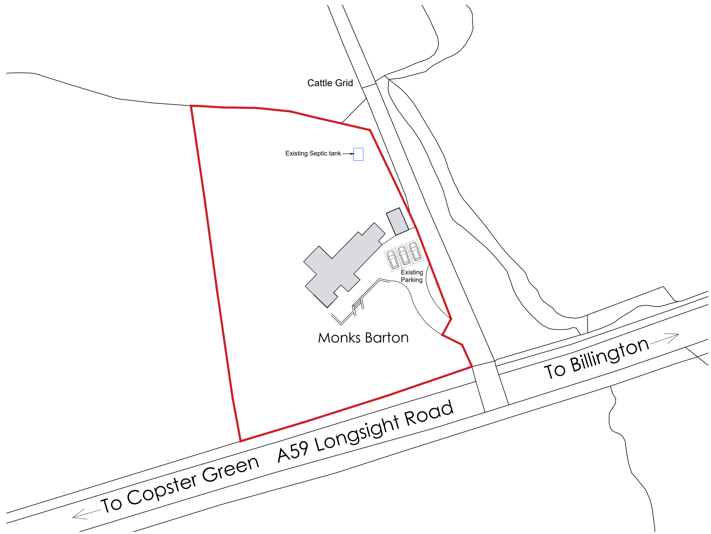
EXISTING SITE PLAN Scale 1:500