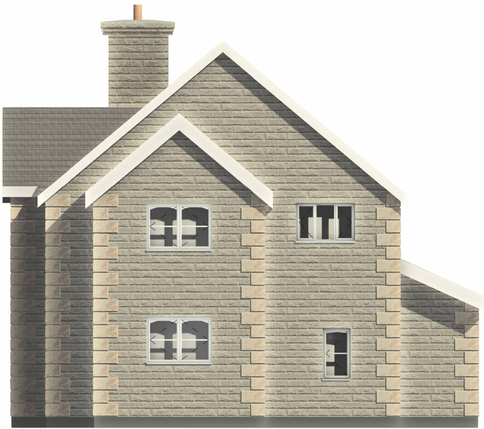
1 EXISTING EAST 1 : 50