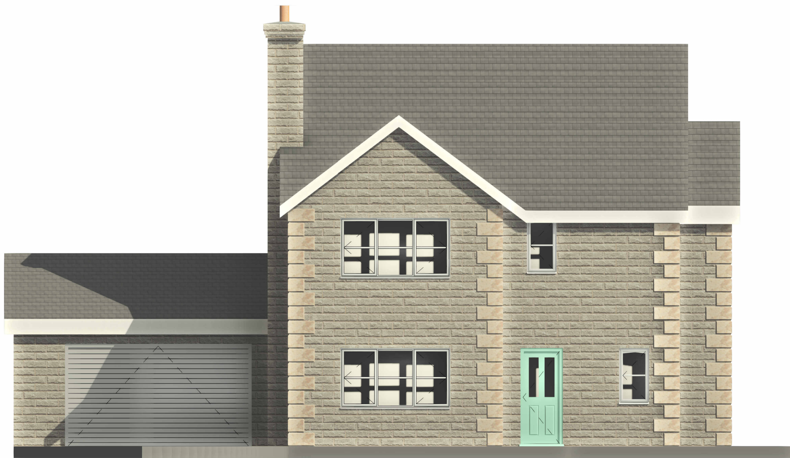
3 EXISTING SOUTH 1 : 50