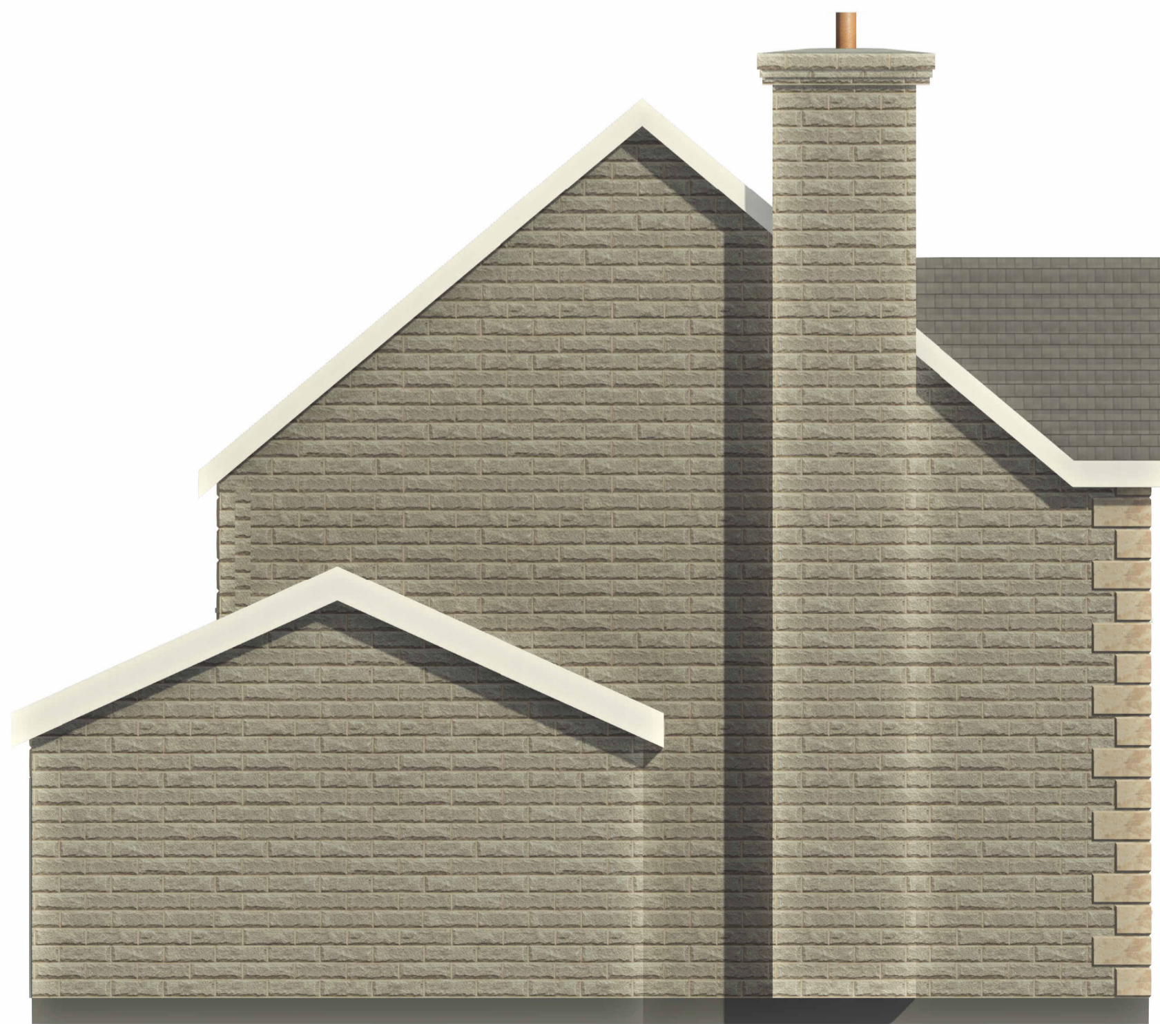
4 EXISTING WEST 1 : 50