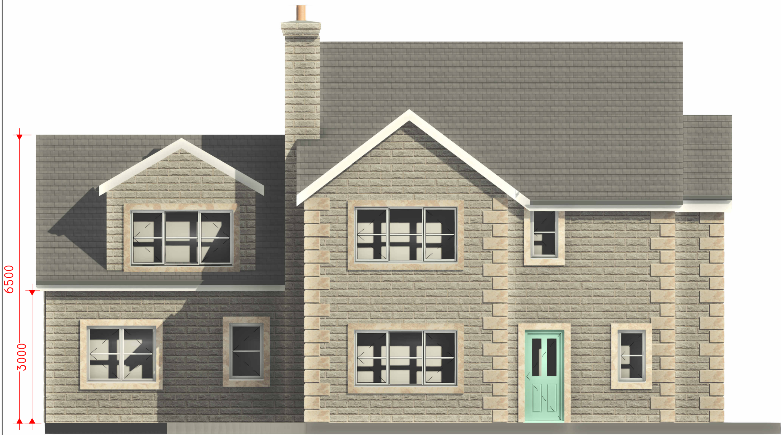
3 PROPOSED SOUTH 1 : 50